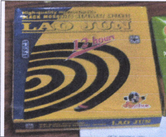
Lao Jun Mosquito Coil