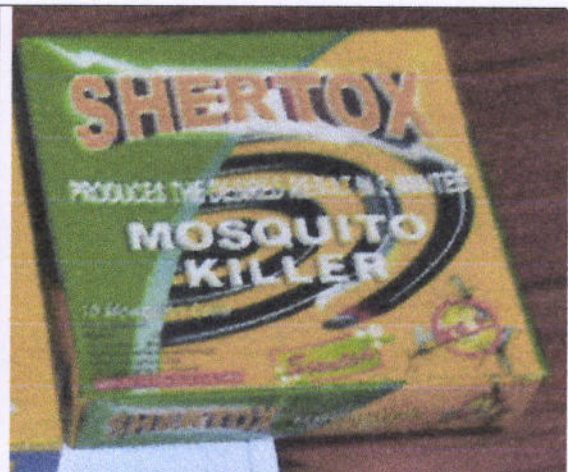
Shertox Mosquito Coil