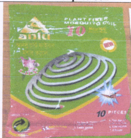
Anlu Plant Fiber Mosquito Coil