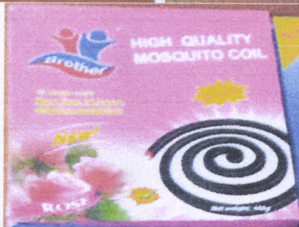
Brother Mosquito Coil