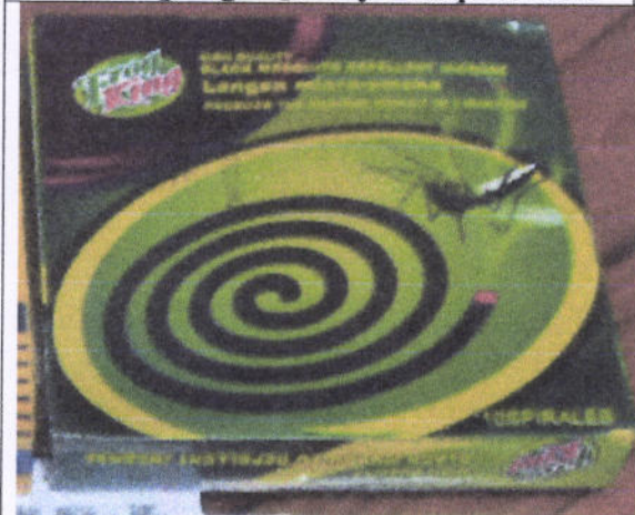
Frog King Mosquito Coil