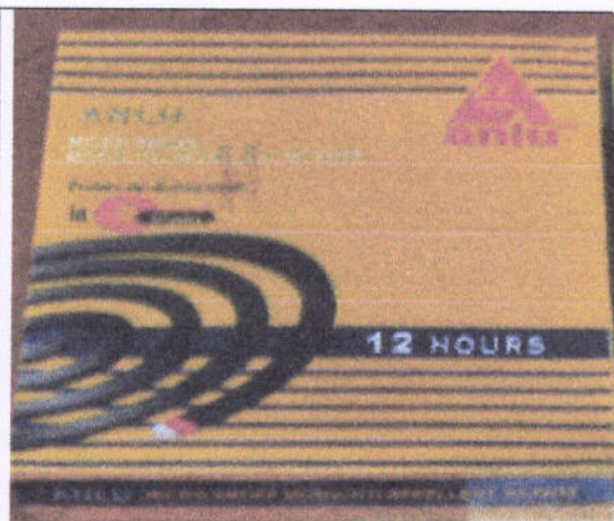
Anlu Mosquito Coil