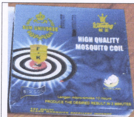
Wawang High Quality Mosquito Coil

The Food and Drug Administration (FDA) advises the public against the use of these unregistered mosquito coils: