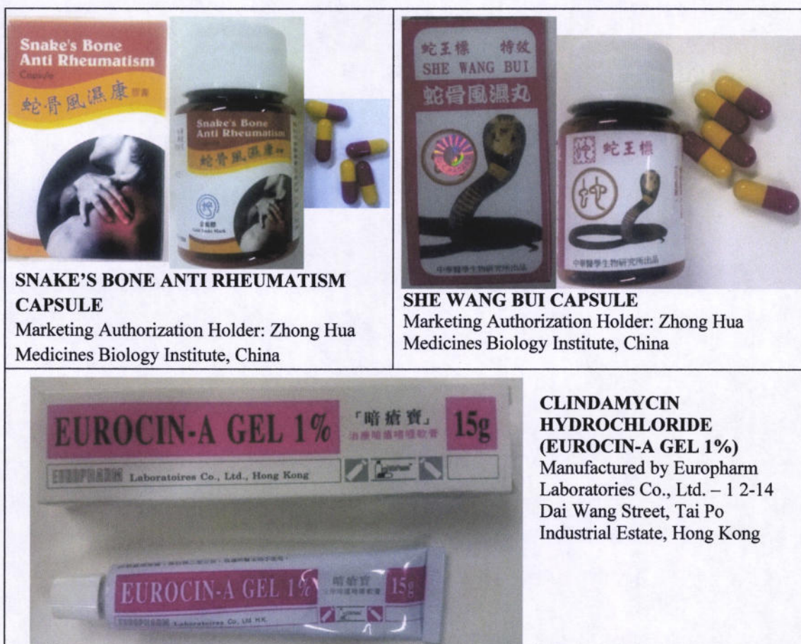
Table 1. Unregistered Drug Products

The abovementioned drug products pose potential danger or injury to the consuming public and the importation, selling or offering for sale of such is in direct violation of Republic Act No. 9711 or the Food and Drug Administration Act of 2009.