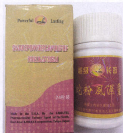
Snake Powder Capsule of Rheumatism Made in USA by: Lidiatel Pharmaceutical Factory Agent of the South East Asia: Kohafa Corporation, Tokyo, Japan