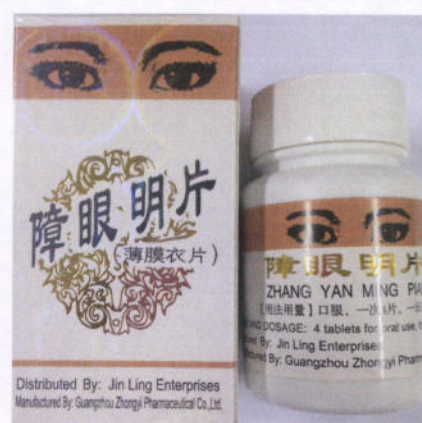
Zhang Yan Ming Pian Manufactured by: Guangzhou Zhongyi Pharmaceutical Co., Ltd. Distributed by: Jin Ling Enterprises