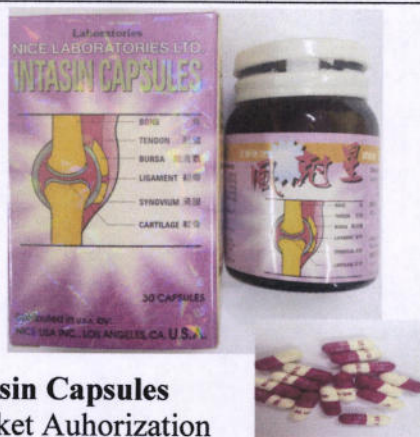
Intasin Capsules Market Auhorization Holder: Nice Laboratories Ltd. Distributed in USA by: NICE USA Inc., Los Angeles, Ca. USA. Table 1.Unregistered Drug Products