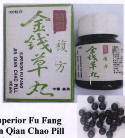
Superior Fu Fang Jin Qian Chao Pill China Guangxi