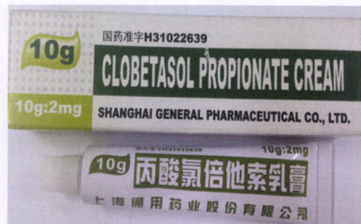
Clobetasol Propionate Cream Market Authorization Holder: Shanghai General Pharmaceutical Co., Ltd.