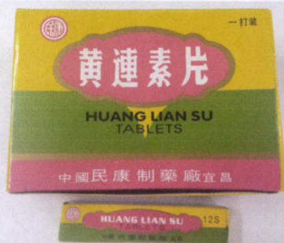
Huang Lian Su Tablets Market Authorization Holder: Minkang Drug Manufactory – Yichang China