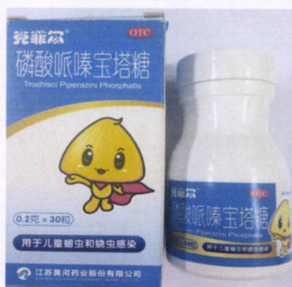
Trochisci Piperazini Phosphatis Market Authorization Holder: Jiangsu Huanghe Pharmacy Share Co., Ltd.