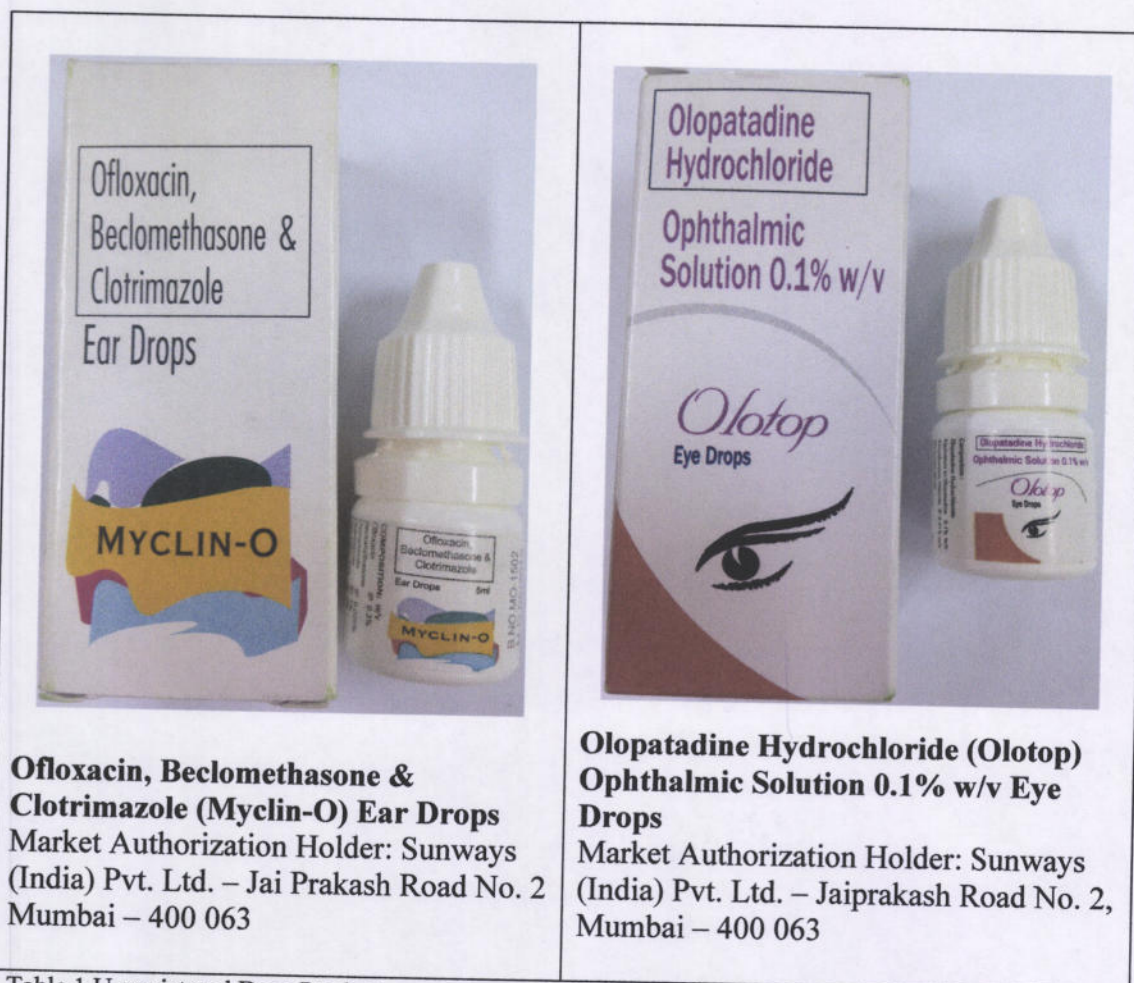
Table 1. Unregistered Drug Products

The Food and Drug Administration advises the public against the use of the following unregistered drug products: