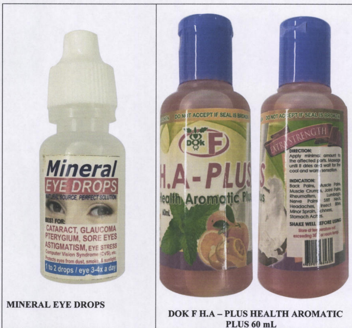
Figure 1. Unregistered Drug Products

The abovementioned drug products pose potential injury to the consuming public and the importation, selling or offering for sale of such is in direct violation of Republic Act No. 9711 or the Food and Drug Administration Act of 2009.