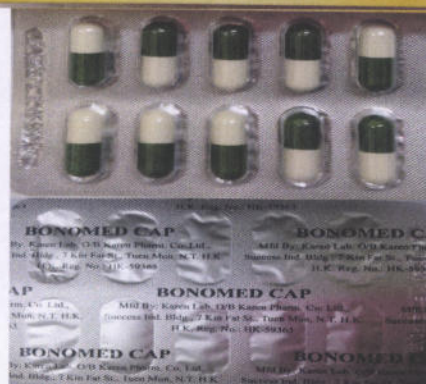
Bonomed Capsules Karen Laboratories O/B Karen Pharmaceutical Co., Ltd. – Flat A & B, 1/F & Flat B 17/F, Success Industrial Building, 7 Kin Fat Street, Tuen Mun, N.T., H.K.