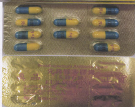
Euracedine 250 mg Capsule Eurasia Pharmaceutical Ltd. France