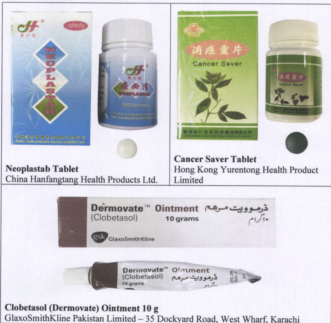
Table 1. Unregistered Drug Products

The Food and Drug Administration (FDA) advises the public against the use of the following unregistered drug products: