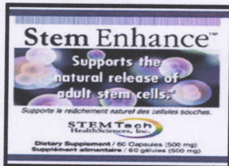
Figure 1. Unregistered StemEnhance™ dietary supplement

This is to reiterate that the product StemEnhance™ is not registered with FDA as stated in FDA Advisory 2013-025 issued on 14 August 2013 entitled "Deceptive On-line Sale and Marketing of Stem Enhance™ Product". This also serves to warn the general public on the continuous online marketing and selling of StemEnhance™ (Figure 1), dubiously labelled as a dietary supplement which claims that it "supports the natural release of adult stem cells" which is completely unrelated to StemEnhance AFA Extract Food Supplement (Figure 2), an FDA registered product.