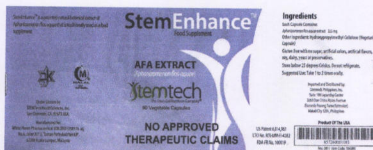
Figure 2. Registered StemEnhance™ AFA Extract Food Supplement