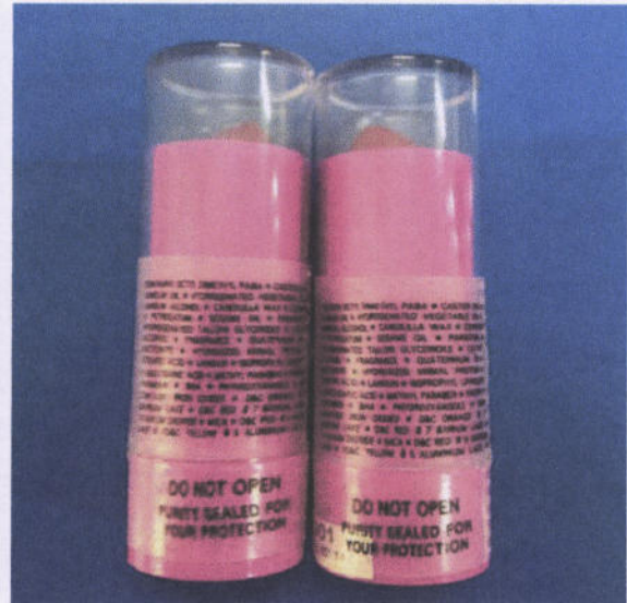
Figure 2. K'CalY Lipstick - 844 Sweet Melody (Back)