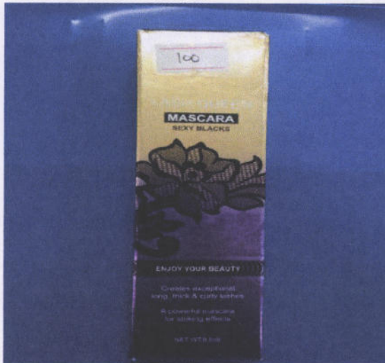
Figure 3. Miss & Mrs. Lash Queen Mascara Sexy Blacks (Principal Display Panel)