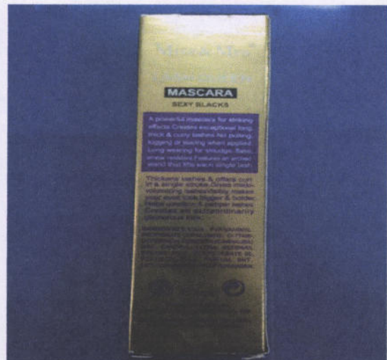
Figure 4. Miss & Mrs. Lash Queen Mascara Sexy Blacks (Back)