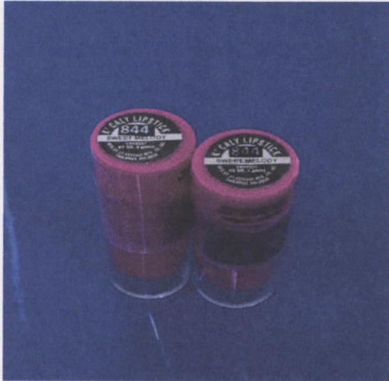
Figure 1. K'CalY Lipstick - 844 Sweet Melody (Principal Display Panel)