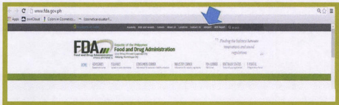
Figure 6. e-Report Section of the FDA Website