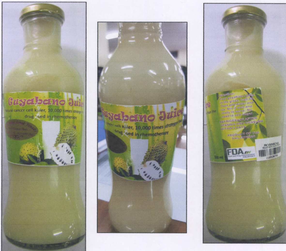
Figure 1. Images of Guyabano Juice with unapproved health claims.

The Food and Drug Administration (FDA) advises the public against the use of a product labelled as Guyabano Juice with unapproved health claims such as "Natural cancer cell killer, 10,000 times stronger than drug used in chemotherapy" .