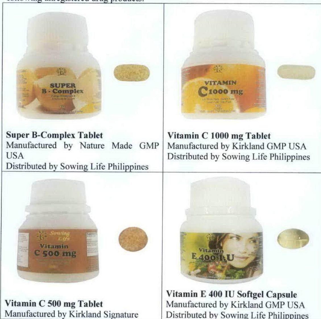
Figure 1. Unregistered Drug Products

The Food and Drug Administration (FDA) advises the public against the use of the following unregistered drug products: