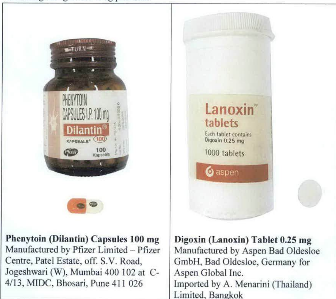
Figure 1. Unregistered Drug Products

The Food and Drug Administration (FDA) advises the public against the use of the following unregistered drug products: