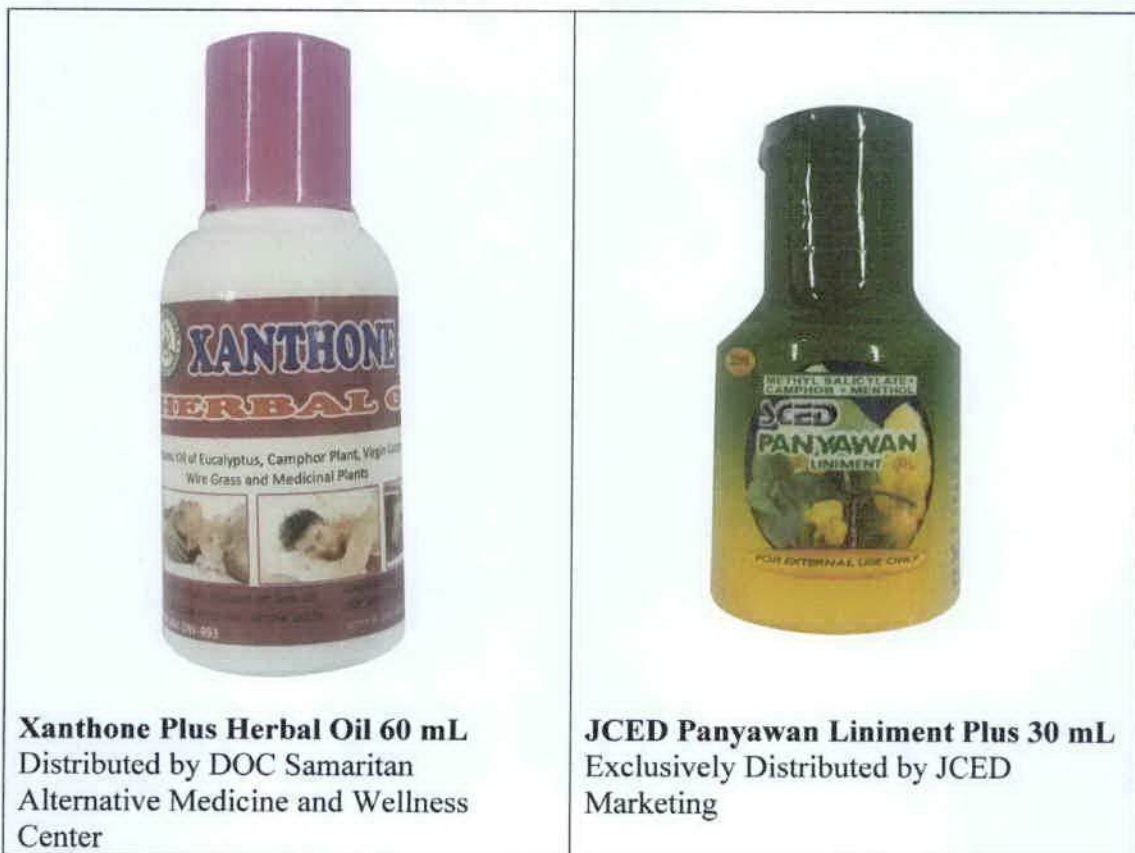
Figure 1. Unregistered Drug Products

The Food and Drug Administration (FDA) advises the public against the use of the following unregistered drug products: