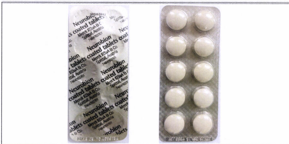
Figure 1: Unregistered Drug Product “Neurobion coated Tablet” of Merck KGaA & Co. Spittal, Austria.

The Food and Drug Administration (FDA) advises the public against the use of the following unregistered drug product which has a registered counterpart brand “Neurobion coated Tablet”: