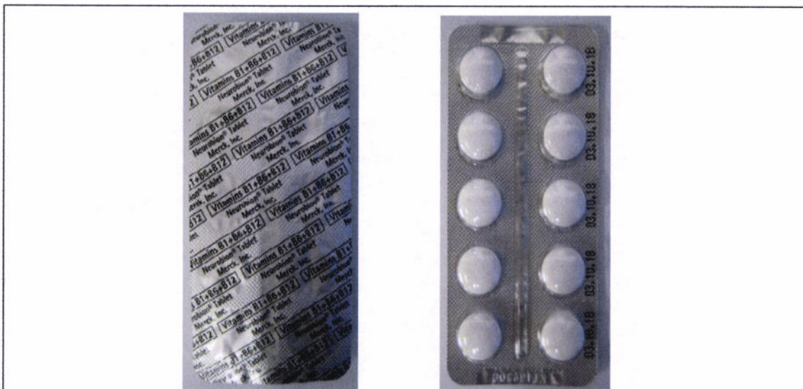
Figure 2: Registered Drug Product Neurobion Tablet (Registration Number: DR-XY31882) Manufactured by PT Merck Indonesia Tbk