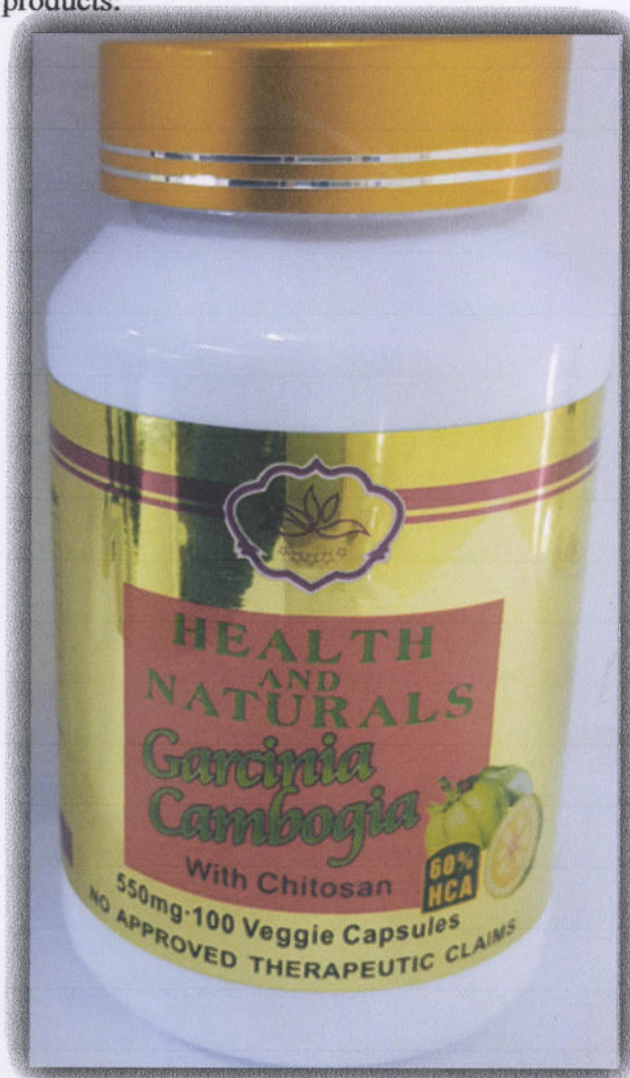
Figure 1. Unregistered Health and Naturals Garcinia cambogia with Chitosan.

The Food and Drug Administration (FDA) advises the public against the use of the following unregistered food products: