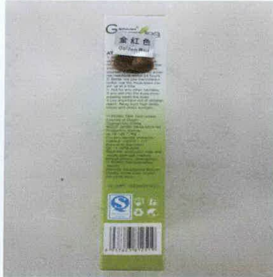
Figure 14. Active-Care® Green Tea Deep Shine Baien Beautiful Inimitable - Golden Red (Side Panel)