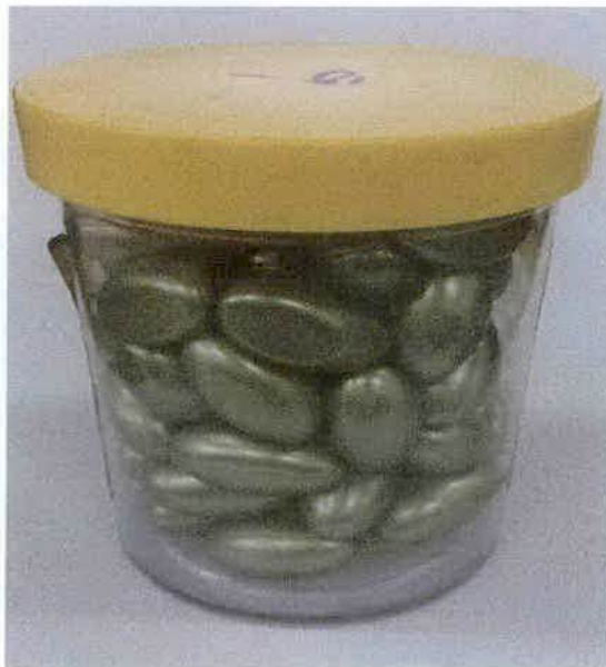
Figure 8. Kangtian 60 Soft Cel Capsules - Green (Back)