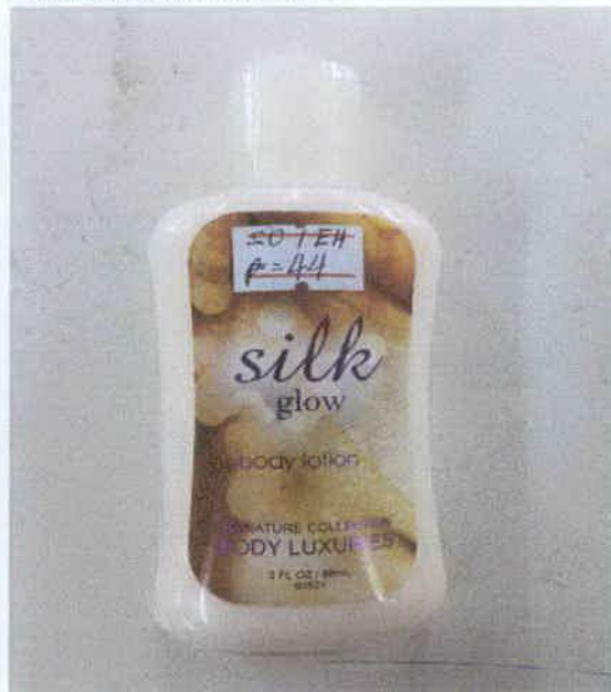
Figure 17. Signature Collection Body Luxuries Silk Glow Body Lotion (Principal Display Panel)