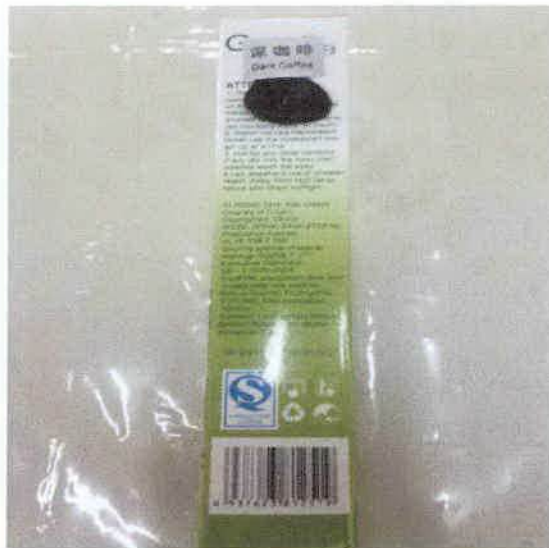
Figure 10. Active-Care® Green Tea Deep Shine Baien Beautiful Inimitable -Dark Coffee (Side Panel)