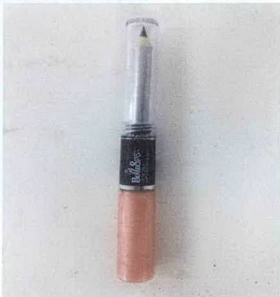
Figure 26. Bellespa Lip Gloss + Lip Liner Pencil (Principal Display Panel)