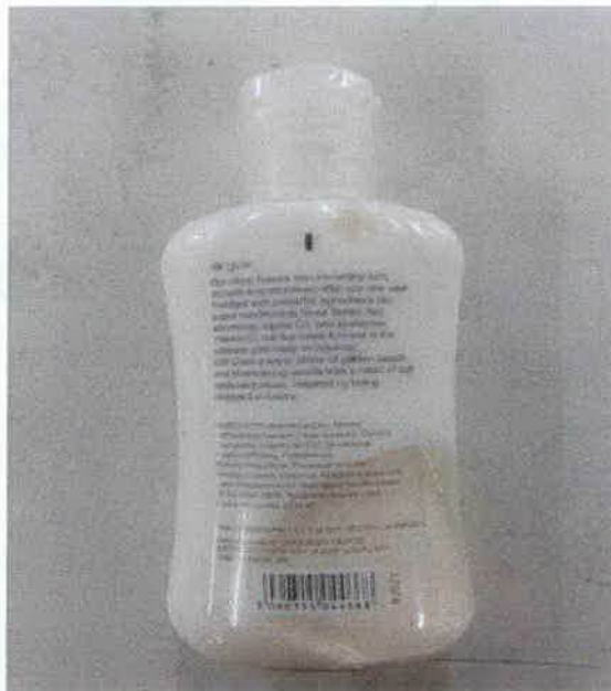
Figure 18. Signature Collection Body Luxuries Silk Glow Body Lotion (Back Panel)