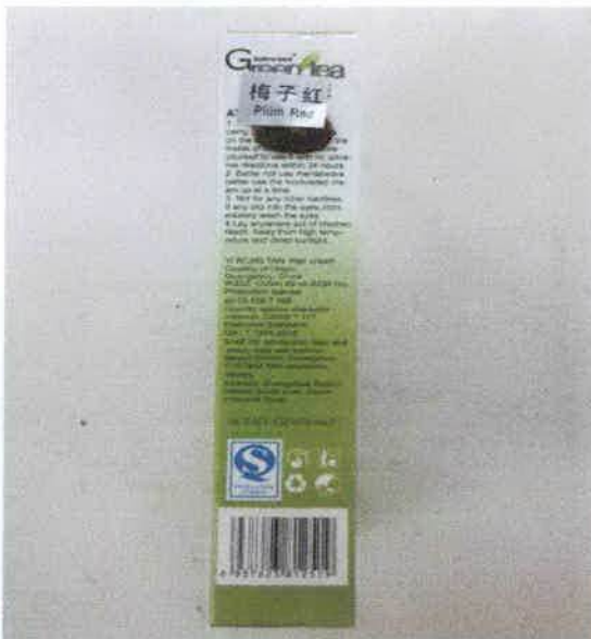
Figure 12. Active-Care® Green Tea Deep Shine Baien Beautiful Inimitable - Plume Red (Side Panel)