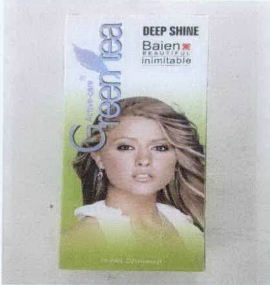
Figure 13. Active-Care® Green Tea Deep Shine Baien Beautiful Inimitable - Golden Red (Principal Display Panel)