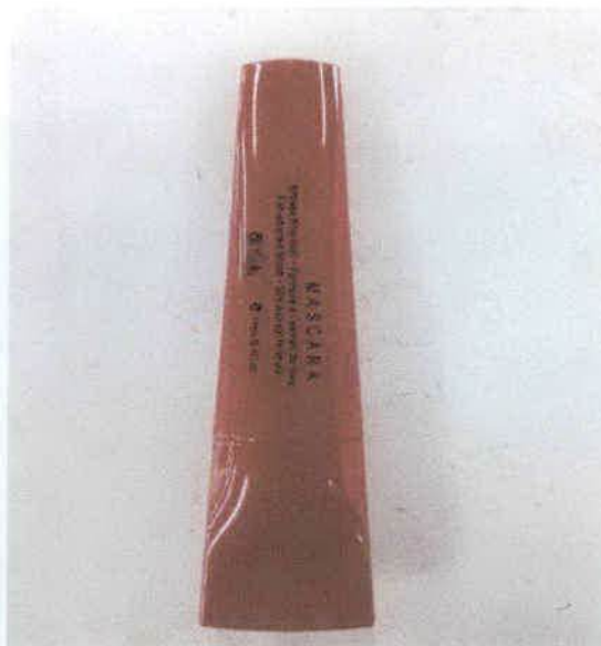
Figure 29. Chanleevi® Mascara Fan-Tastic Volume (Back Panel)