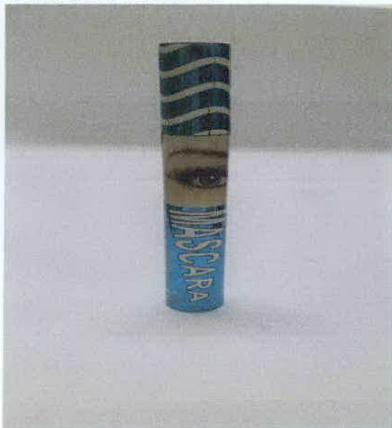
Figure 22. Jialiqi Volume Mascara Ultra Resistance Luxurious Eye Make-Up - Dense (Principal Display Panel)