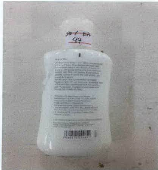
Figure 16. Signature Collection Body Luxuries Enjoy Life Body Lotion (Back Panel)