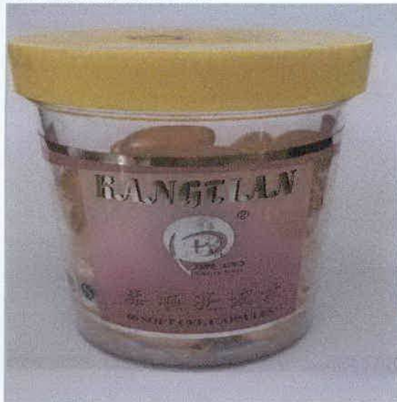
Figure 5. Kangtian 60 Soft Cel Capsules - Pink (Principal Display Panel)