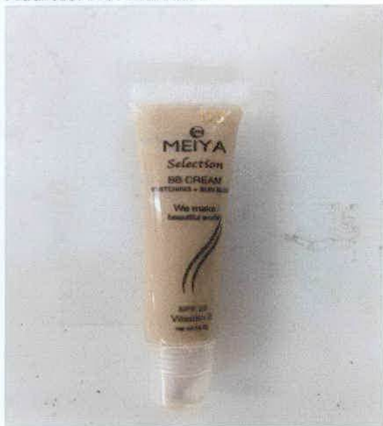
Figure 24. Meiya Selection BB Cream Whitening + Sun Block SPF 25 Vitamin E (Principal Display Panel)