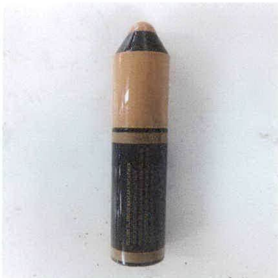
Figure 20. Charm 3D Jialiqi Cosmetics Length Fiber Extensions Mascara Waterproof (Back Panel)