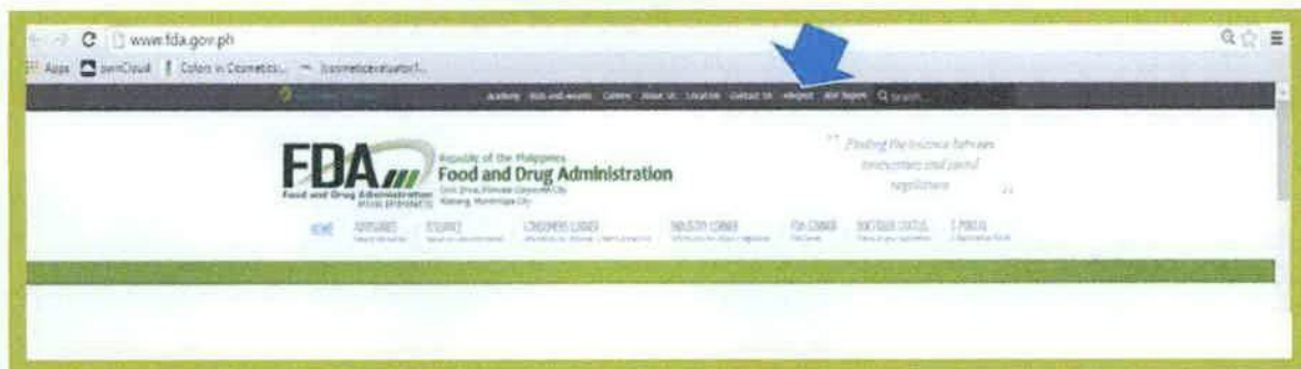
Figure 33. e-Report Section of the FDA Website