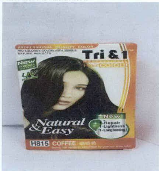
Figure 1. Tri & 1™ Professional Hair Colour - H815 Coffee (Principal Display Panel)