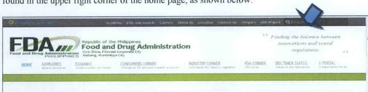
Figure 32. FDA Website Homepage

Unnotified cosmetic products, not having been verified by FDA, pose potential health hazards to the consuming public. FDA cannot guarantee their quality and safety. The use of substandard and possibly adulterated cosmetic products may result to adverse reactions including but not limited to skin irritation, itchiness and anaphylactic shock. Thus, the public is advised to always verify if a cosmetic product has been notified with FDA before purchasing it. Consumers can do this by going to the FDA website ( www.fda.gov.ph ) and making use of the Search tab found in the upper right corner of the home page, as shown below: