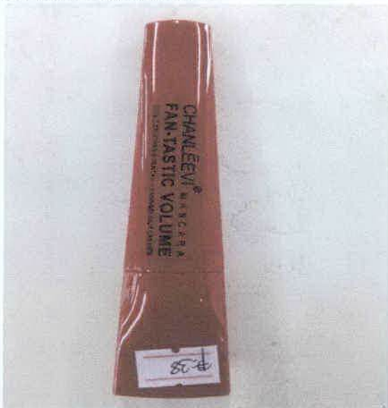
Figure 28. Chanleevi® Mascara Fan-Tastic Volume (Principal Display Panel)