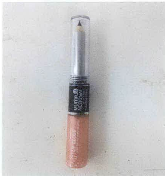
Figure 27. Bellespa Lip Gloss + Lip Liner Pencil (Back Panel)