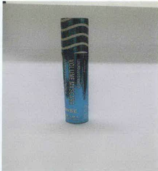
Figure 23. Jialiqi Volume Mascara Ultra Resistance Luxurious Eye Make-Up - Dense (Back Panel)