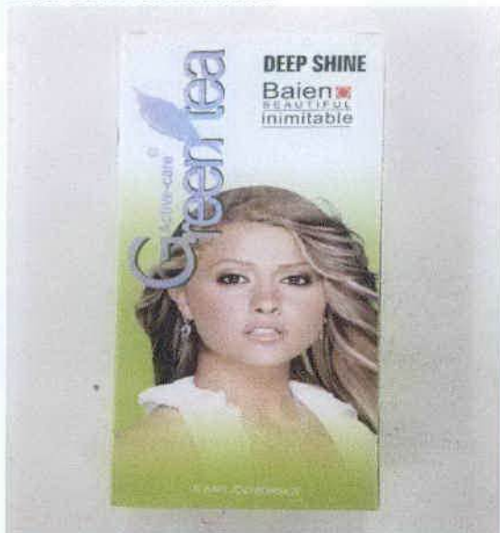
Figure 11. Active-Care® Green Tea Deep Shine Baien Beautiful Inimitable - Plume Red (Principal Display Panel)