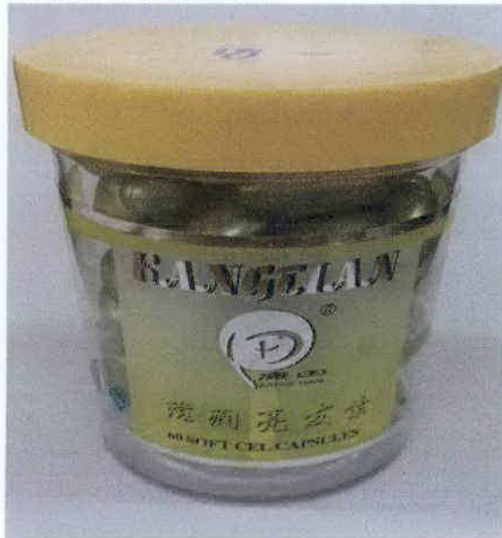
Figure 7. Kangtian 60 Soft Cel Capsules - Green (Principal Display Panel)