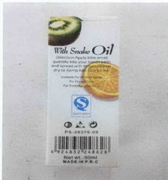
Figure 31. Nutrition Hair Oil Fruits with Snake Oil (Back Panel)