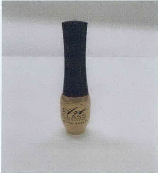
Figure 21. Jialiqi® Art Class Liquid Eyeliner (Principal Display Panel)