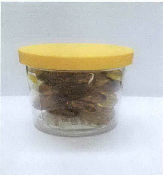
Figure 4. Kangtian 60 Soft Cel Capsules - Yellow (Back)