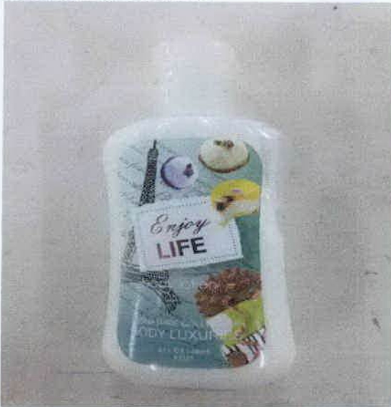
Figure 15. Signature Collection Body Luxuries Enjoy Life Body Lotion (Principal Display Panel)