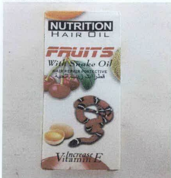
Figure 30. Nutrition Hair Oil Fruits with Snake Oil (Principal Display Panel)