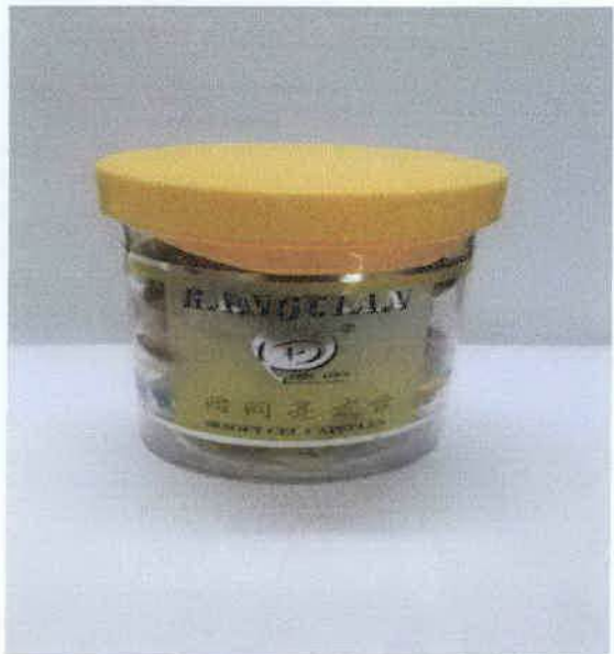
Figure 3. Kangtian 60 Soft Cel Capsules - Yellow (Principal Display Panel)