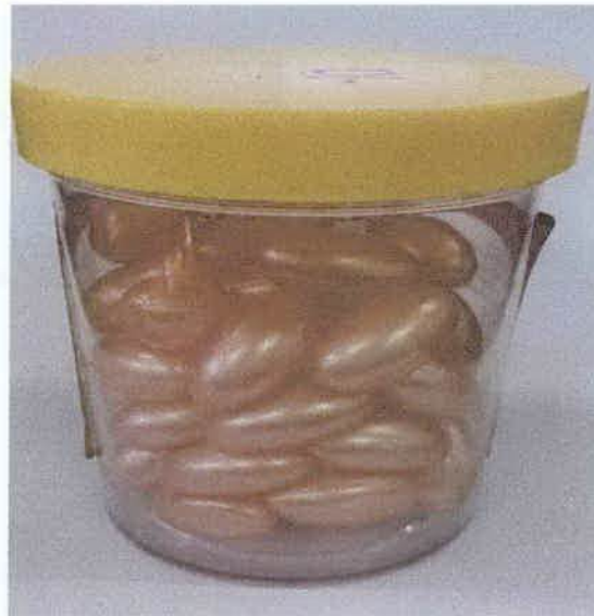
Figure 6. Kangtian 60 Soft Cel Capsules - Pink (Back)