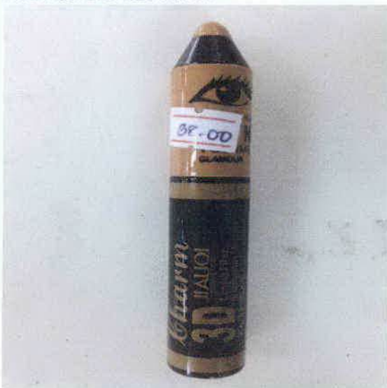
Figure 19. Charm 3D Jialiqi Cosmetics Length Fiber Extensions Mascara Waterproof (Principal Display Panel)