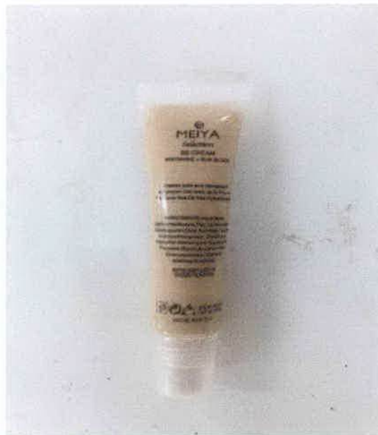
Figure 25. Meiya Selection BB Cream Whitening + Sun Block SPF 25 Vitamin E (Back Panel)