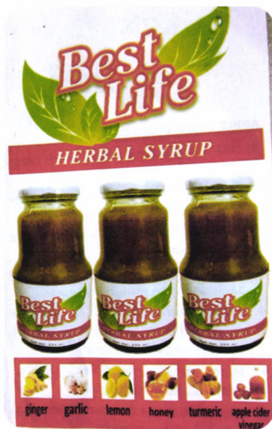
Figure 1. Front of the Brochure reflecting the brand Name and product name

The Food and Drug Administration (FDA) advises the public against the use of the unregistered food product "BEST LIFE Herbal Syrup".