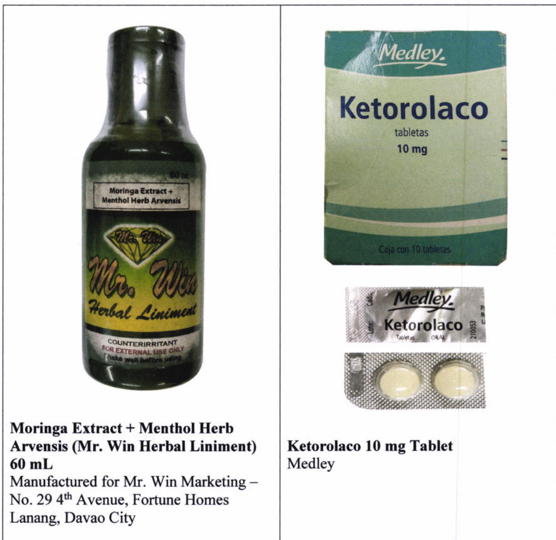
Figure 1. Unregistered Drug Products

The Food and Drug Administration (FDA) advises the public against the use of the following unregistered drug products: