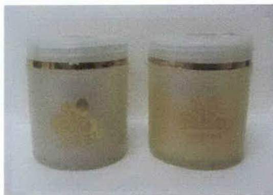
Figure 2. Jiachuntang Ban Gan Jing Qu Ban Shuang (Primary Display Panel, Immediate Packaging)

The manufacture, importation, exportation, distribution, sale, offer for sale, transportation, promotion and/or advertisement of these non-compliant products is in direct violation of R.A. 9711.