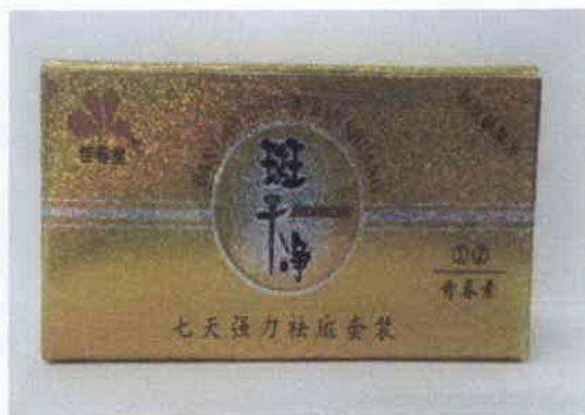
Figure 1. Jiachuntang Ban Gan Jing Qu Ban Shuang (Primary Display Panel, Outer Packaging)