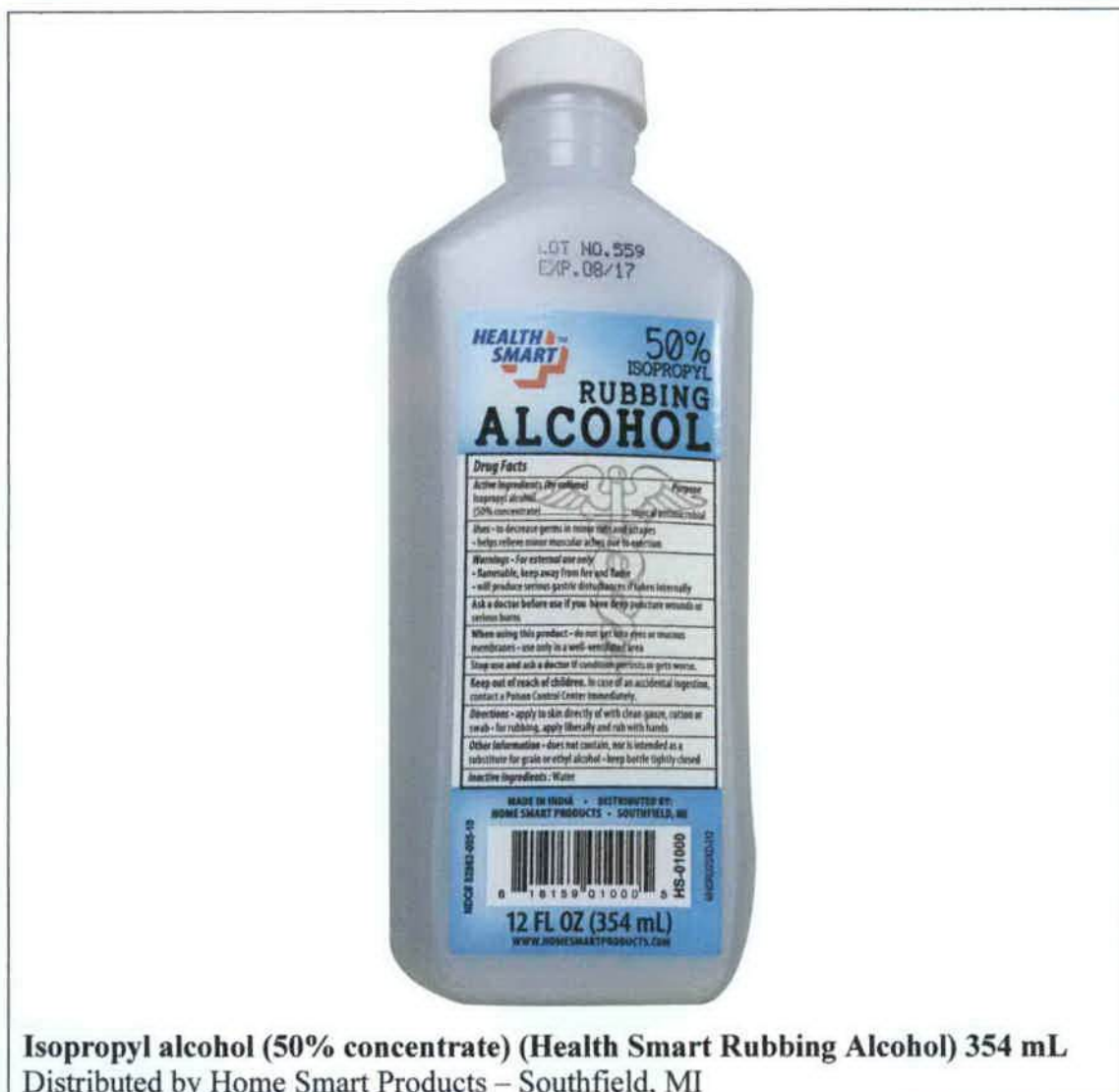
Isopropyl alcohol (50% concentrate) (Health Smart Rubbing Alcohol) 354 mL Distributed by Home Smart Products – Southfield, MI

The Food and Drug Administration (FDA) advises the public against the use of the following unregistered drug products: