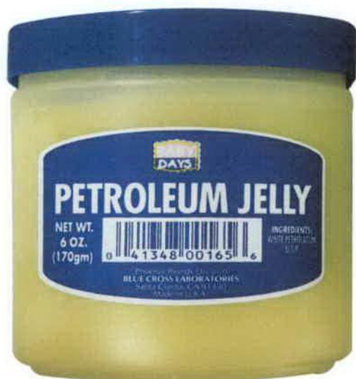
White Petrolatum USP (Baby Days Petroleum Jelly) 170 gm Phoenix Brands Division, Blue Cross Laboratories - Santa Clarita, CA 91350