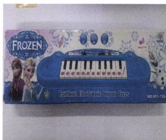
Figure 4. Back Panel