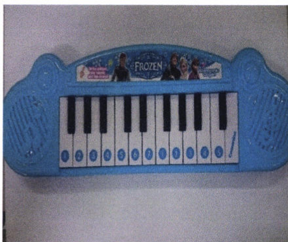
Figure 3. Actual Product