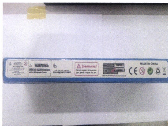
Figure 2. Side Panel