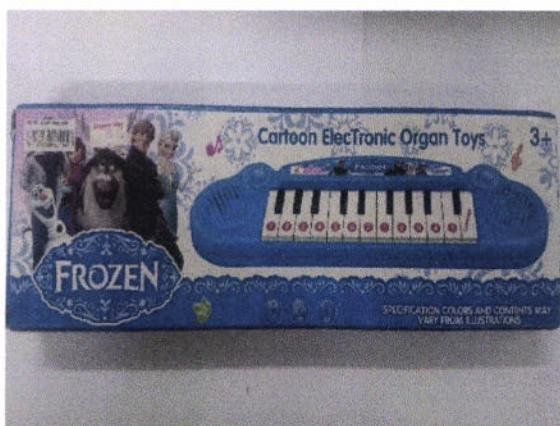
Figure 1. Principal Display Panel