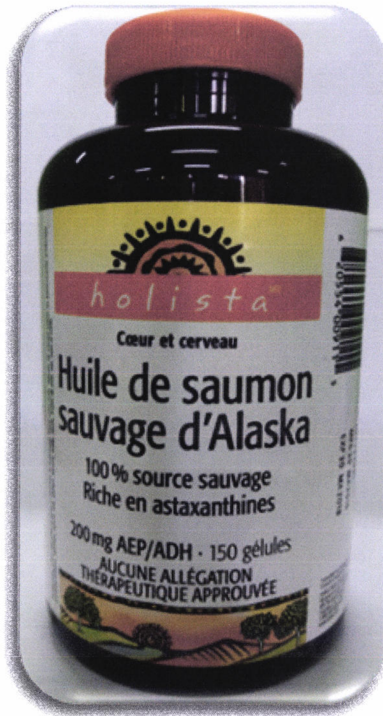
Figure 8. HOLISTA Wild Alaska Salmon Oil 100% Wild Source Rich in Astaxanthin 200mg EPA/DHA 150 softgels