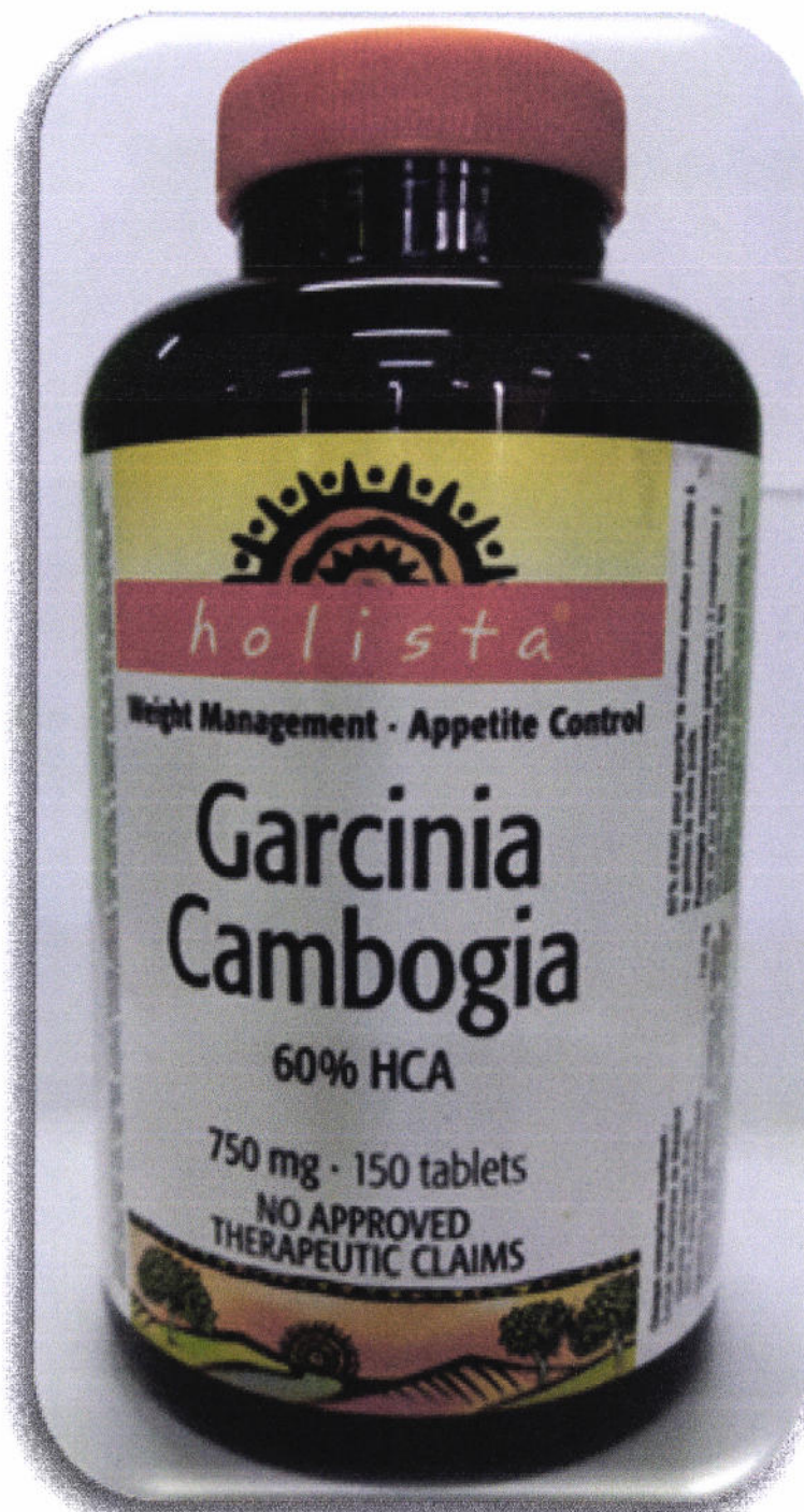
Figure 7. HOLISTA Garcinia Cambogia 60% HCA 750mg/150 tablets