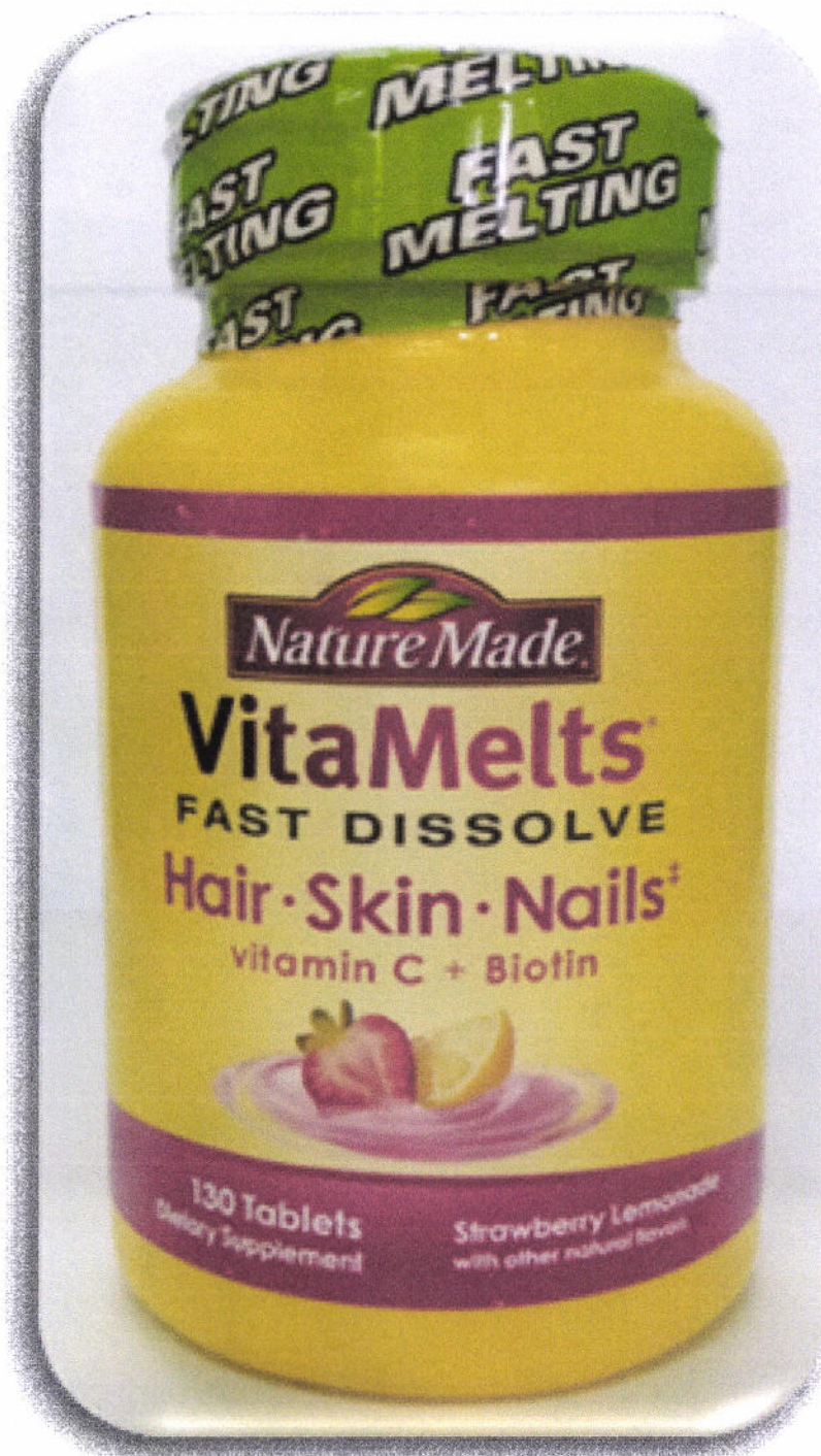
Figure 4. NATURE MADE VitaMelts Fast Dissolve Hair. Skin. Nails Vitamin C + Biotin 130 Tablets Dietary Supplement Strawberry Lemonade with other natural flavors