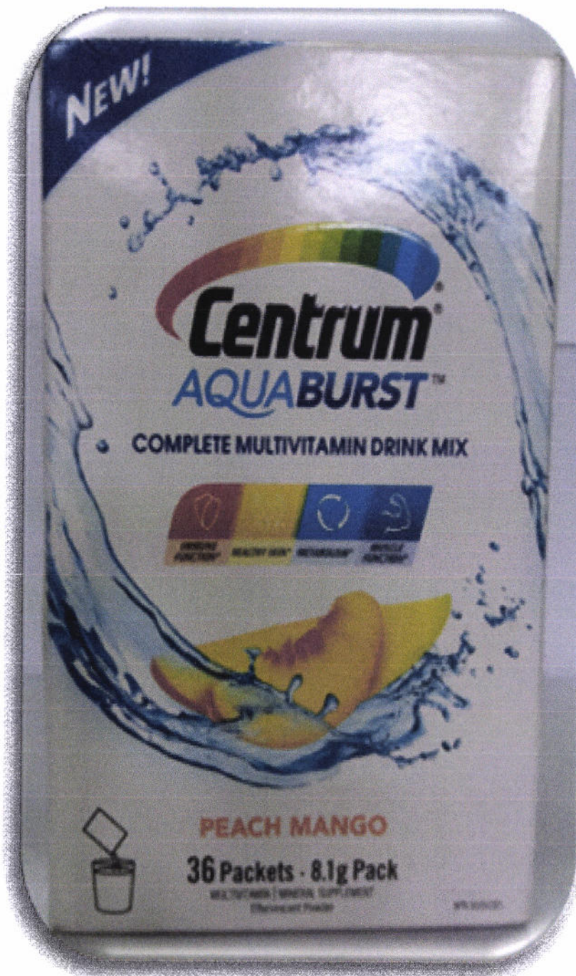
Figure 2. CENTRUM AQUA BURST Complete Multivitamin Drink Mix peach Mango 36 Packets – 8.1 g Pack Multivitamin/ Mineral Supplement Effervescent Powder