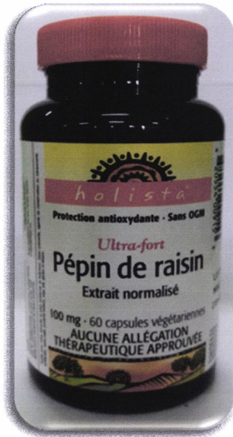
Figure 6. HOLISTA Antioxidant Protection Non-GMO Super Strength Grape Seed Standardized Extract 100mg 60 Vegetarian Capsules