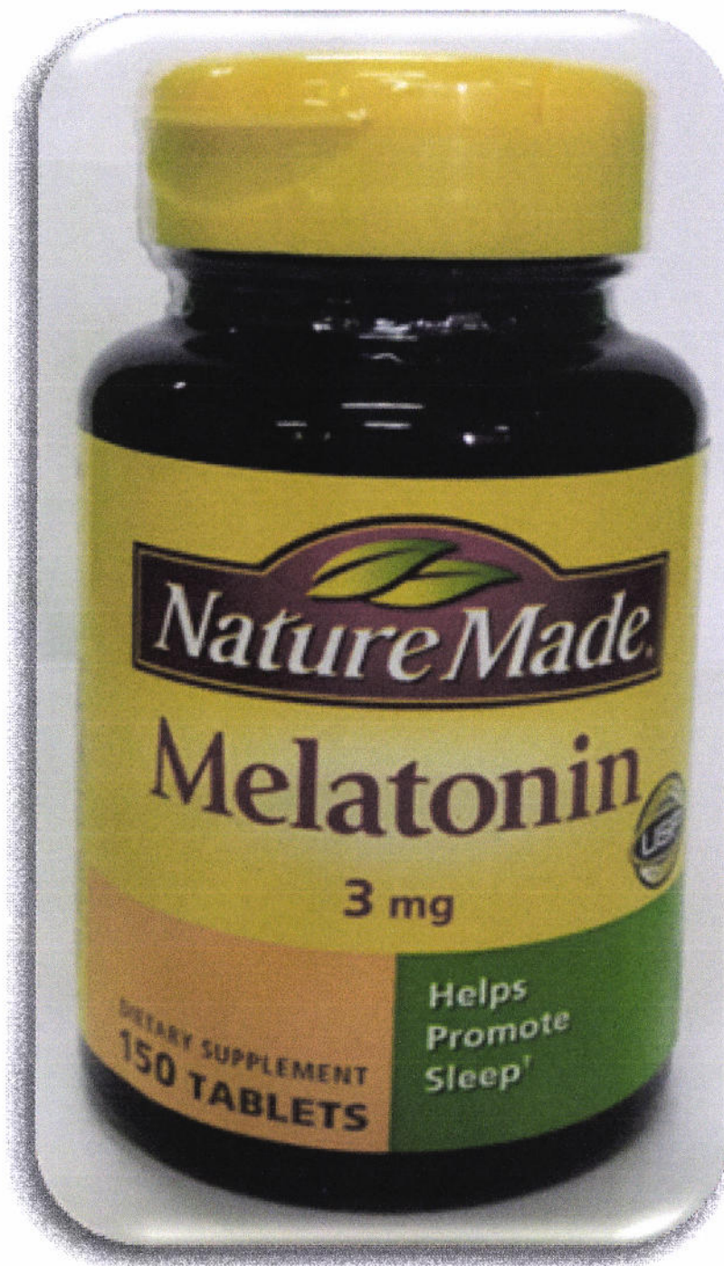
Figure 3. NATURE MADE Melatonin 3 mg Dietary Supplement 150 Tablets