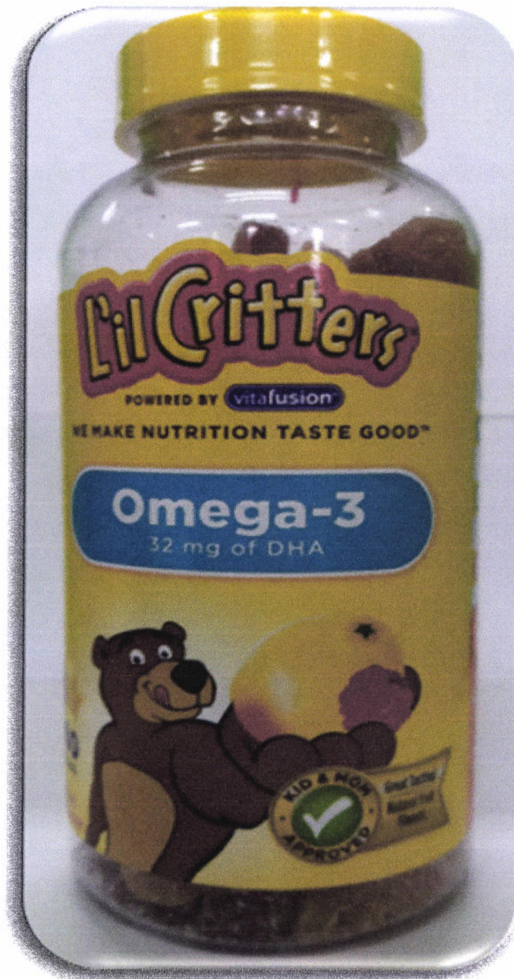
Figure 9. L'IL CRITTERS Powered by vitafusion Omega-# 32 mg of DHA 180 gummies Dietary Supplement Natural Raspberry and Lemonade Flavors