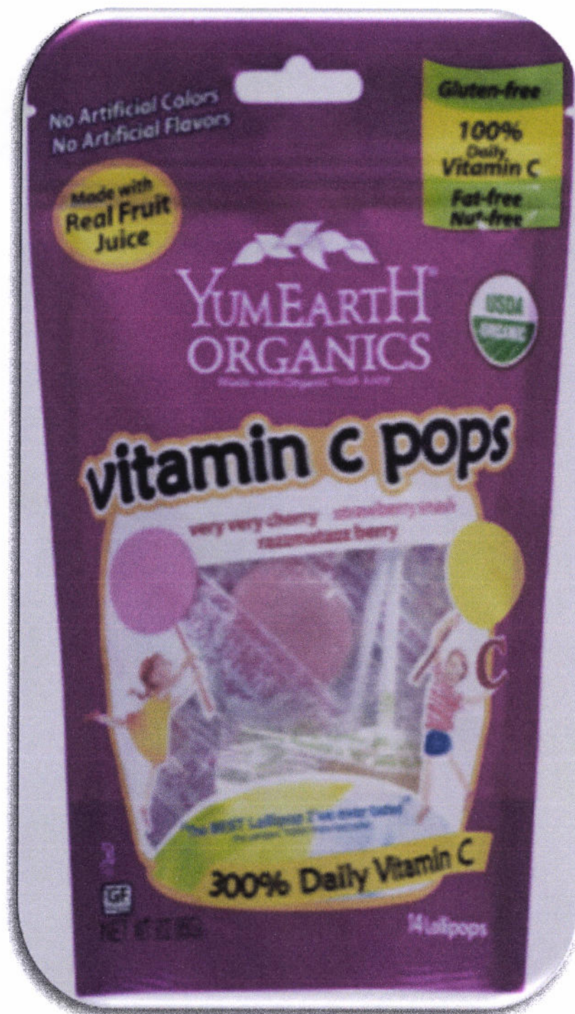
Figure 10. YUM EARTH Organic Vitamin C Pops Strawberry Smash, Very Very Very Cherry, Razzmatazz berry Naturally Flavored Net Wt. 3 oz (85g_ / 14 pops)