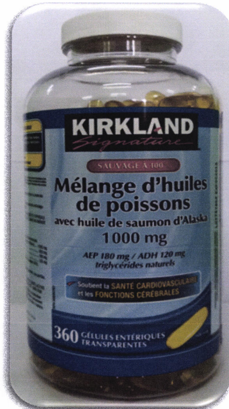
Figure 1. KIRKLAND SIGNATURE Sauvage A 100% Melange d'huiles de poissons Avec huile de saumon d' Alaska (100% Wild Fish Oil Blend with Alaskan Salmon Oil) 1000mg/ 360 softgels

The Food and Drug Administration (FDA) advises the public against the use of the following unregistered food products: