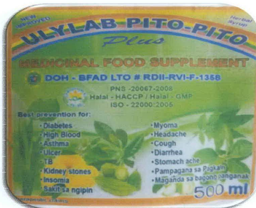
Figure 5. Label of ULYLAB Pito-Pito Plus Medicinal Food Supplement with violative therapeutic claims