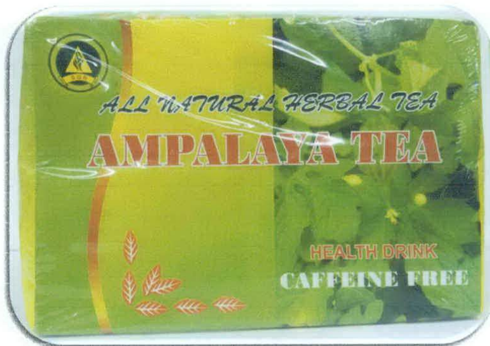
Figure 4. Label of SGB All Natural Herbal Tea Ampalaya Tea Health Drink