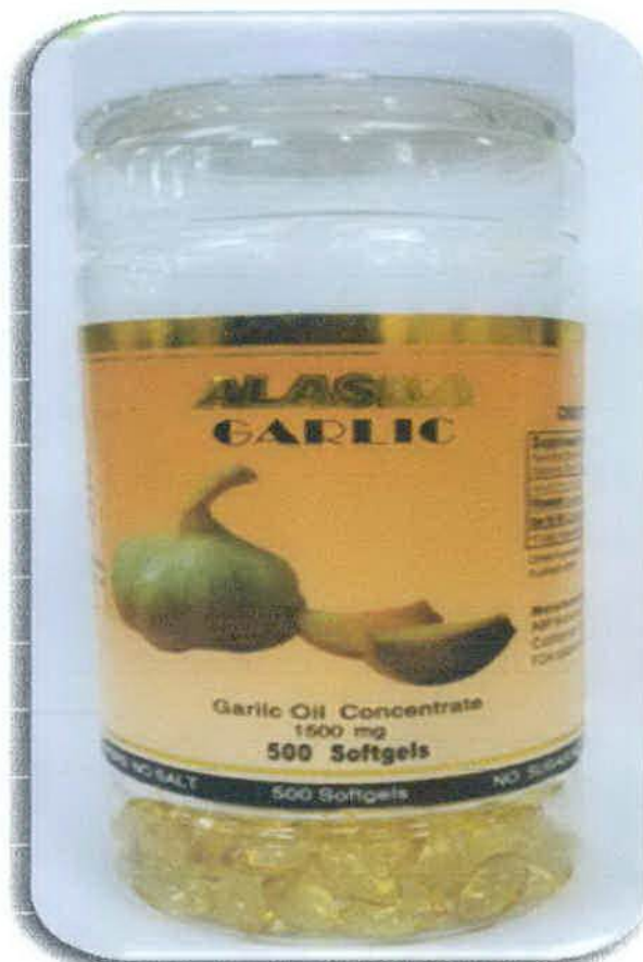
Figure 3. Label of ALASKA Garlic Oil Concentrate Softgels