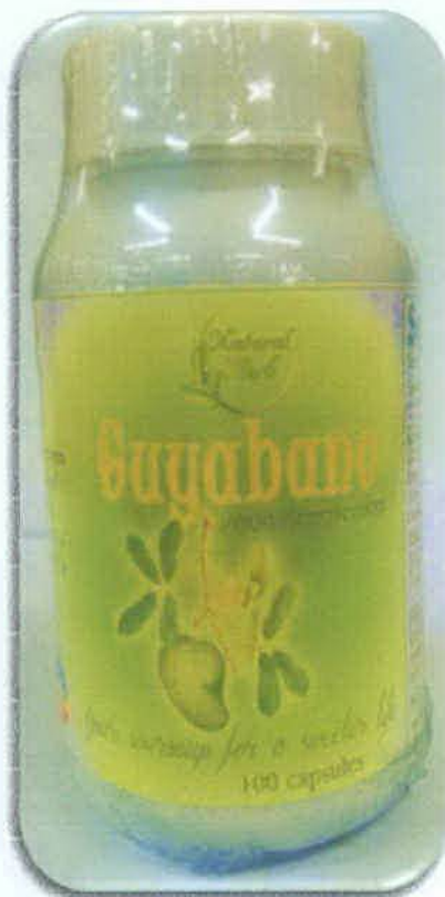
Figure 1a. Front label of NATURAL HERB Guyabano Food Supplement

The Food and Drug Administration (FDA) advises the public against the use of the following unregistered food products: