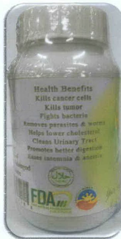
Figure 1b. Side label of NATURAL HERB Guyabano Food Supplement with violative therapeutic claims