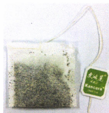
Figure 2. Packaging of Box by 10 and 60 teabags presentations of the unregistered Kancura Herbal Tea