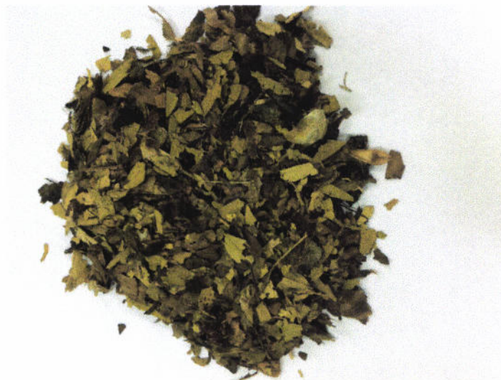
Figure 3. Packaging of Fiber Lined Aluminum Can by 80 g presentation of the unregistered Kancura Herbal Tea