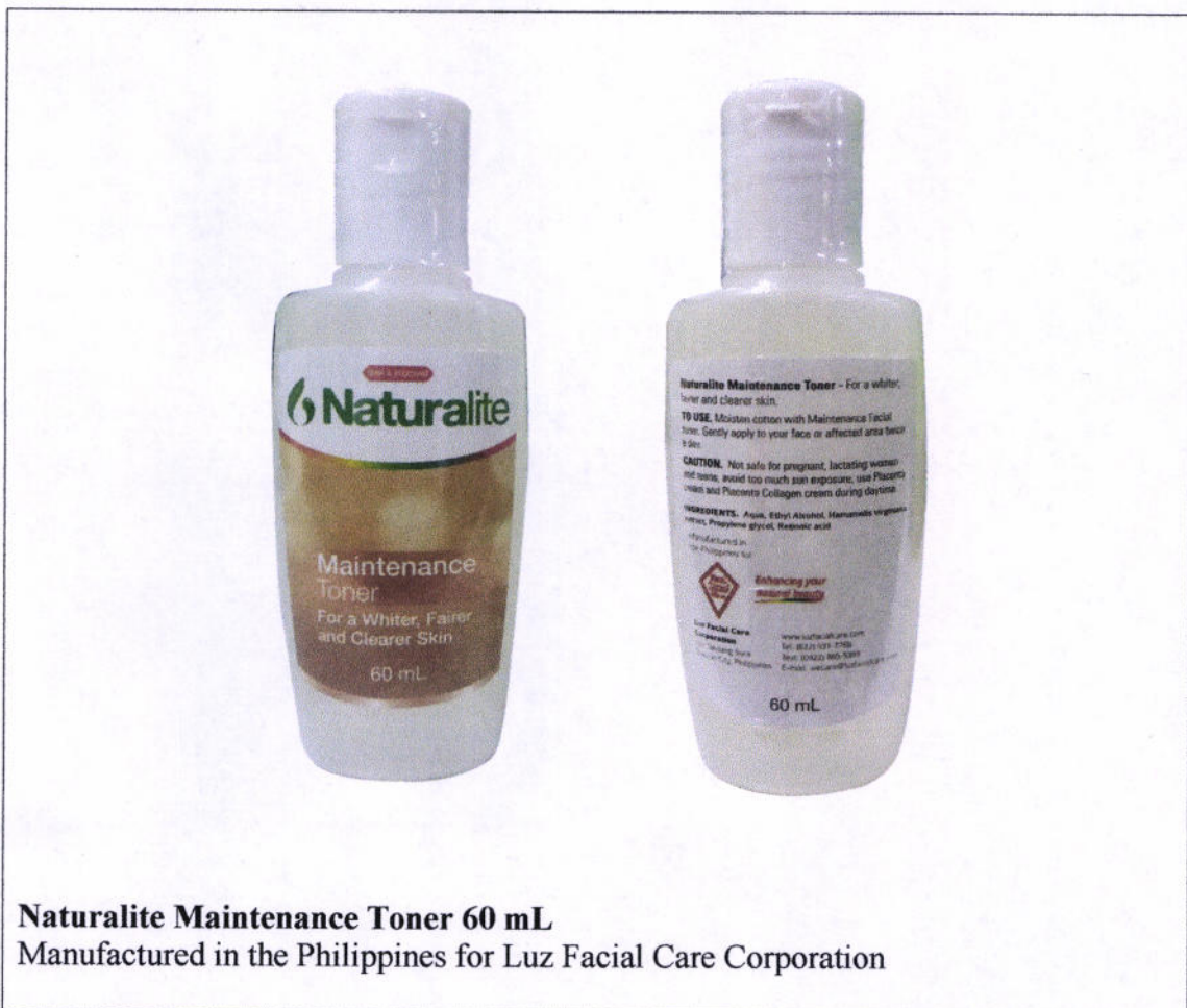
Naturalite Maintenance Toner 60 mL Manufactured in the Philippines for Luz Facial Care Corporation

The Food and Drug Administration (FDA) advises the public against the use of the following unregistered drug products: