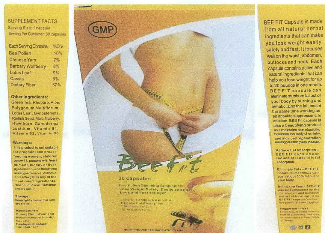
Figure 3. Bee Fit Bee Pollen Slimming Supplement