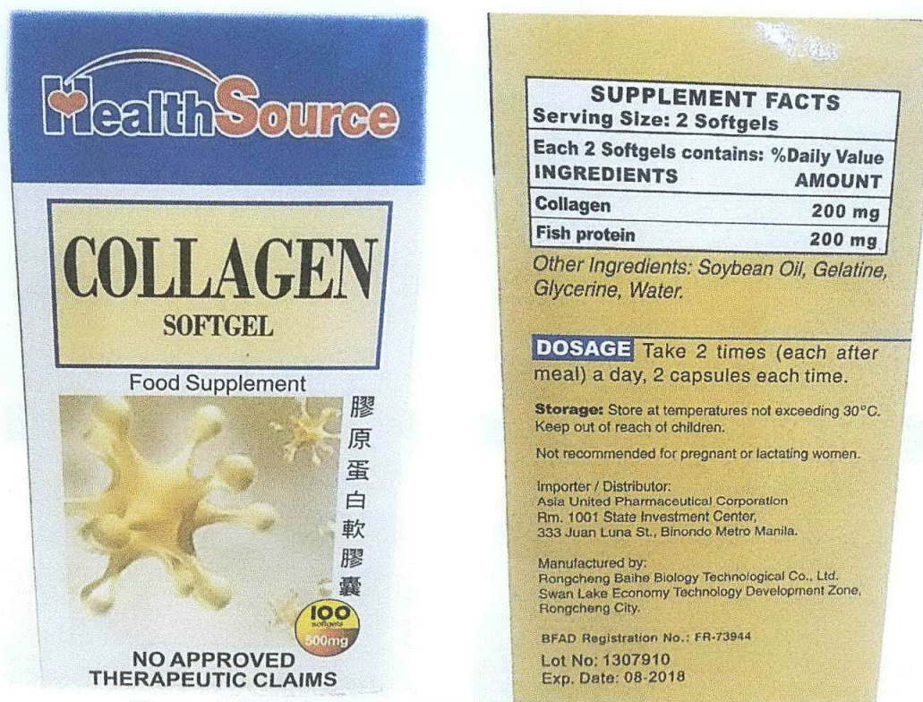
Figure 1. Health Source Collagen Softgel Food Supplement

The Food and Drug Administration (FDA) advises the public against the purchase consumption of the following unregistered food supplements: