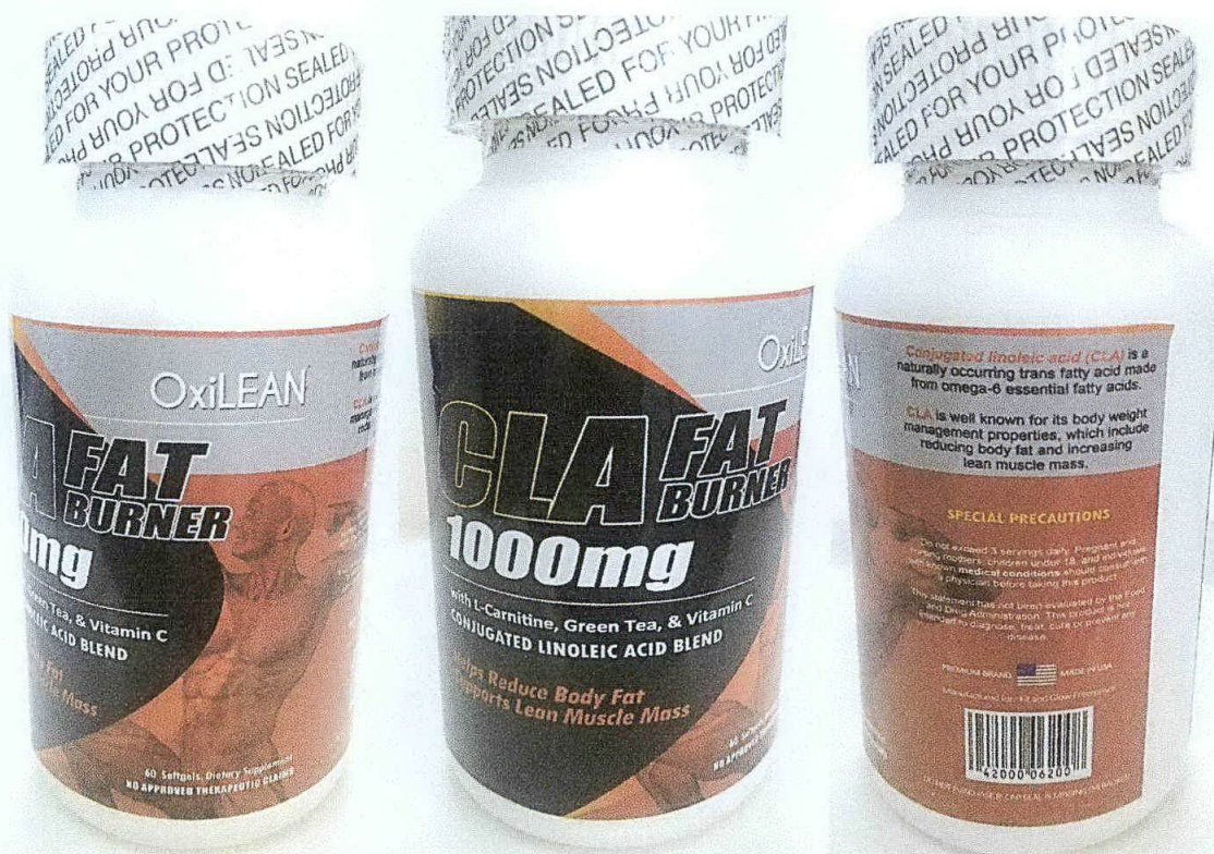
Figure 3. Unregistered Oxilean CLA Fat Burner 1000mg