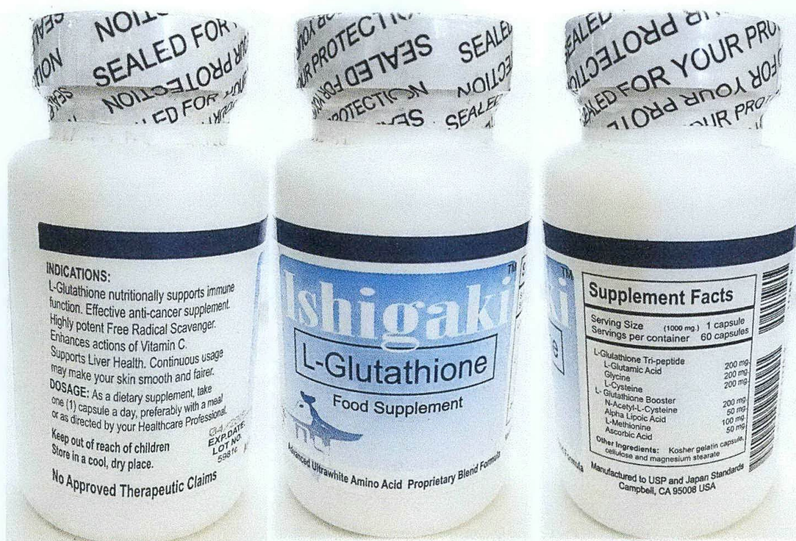
Figure 2. Unregistered Ishigaki L-Glutathione Food Supplement