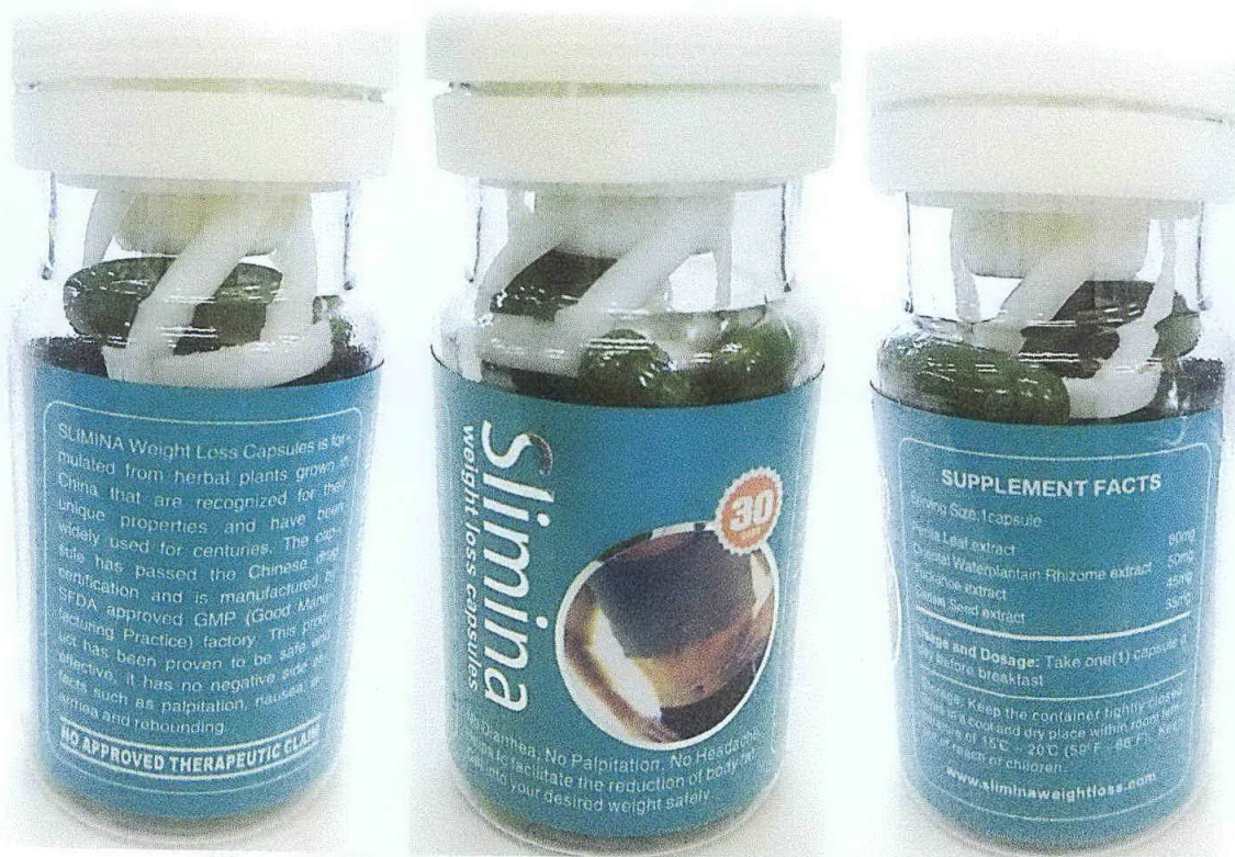
Figure 1. Unregistered Slimina Weight Loss Capsules

The Food and Drug Administration (FDA) advises the public against the purchase and consumption of the following unregistered food supplements: