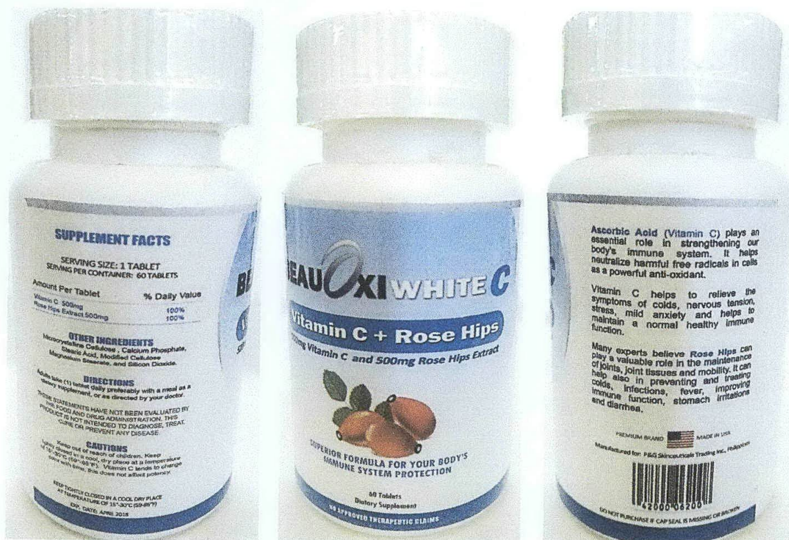
Figure 1. Unregistered BeauOxiwhite C Vitamin C + Rose Hips

The Food and Drug Administration (FDA) advises the public against the purchase and consumption of the following unregistered food supplements: