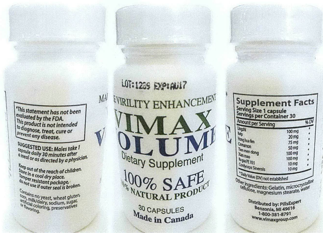
Figure 3. Unregistered Male Virility Enhancement Vimax Volume Dietary Supplement