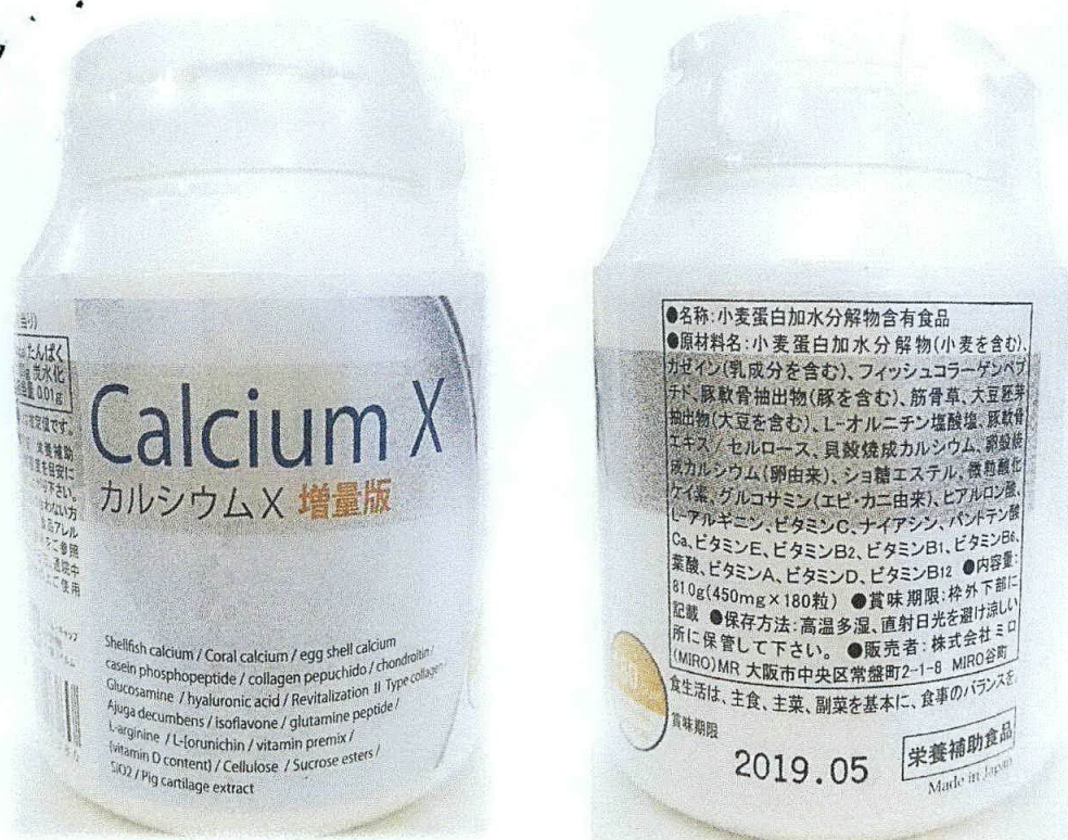
Figure 2. Unregistered Calcium X