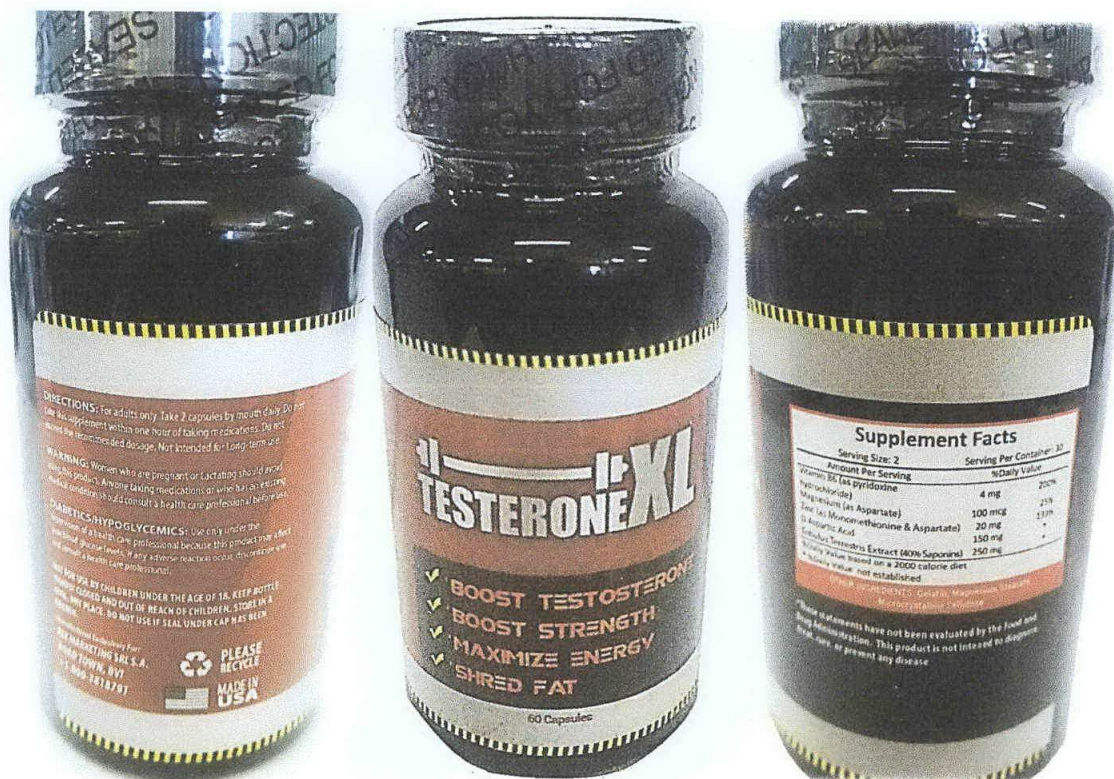
Figure 1. Unregistered Testosterone XL

The Food and Drug Administration (FDA) advises the public against the purchase and consumption of the following unregistered food supplements: