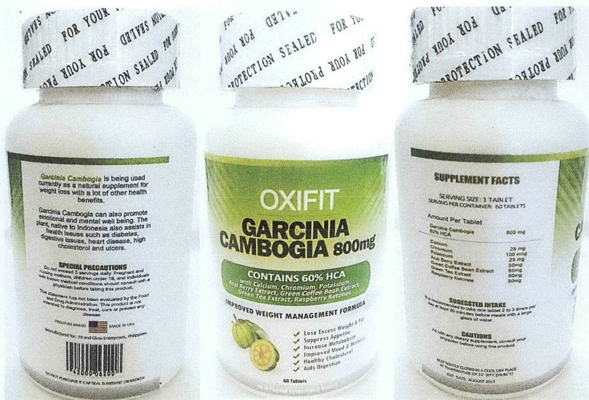
Figure 2. Unregistered Oxifit Garcinia Cambogia 800 mg