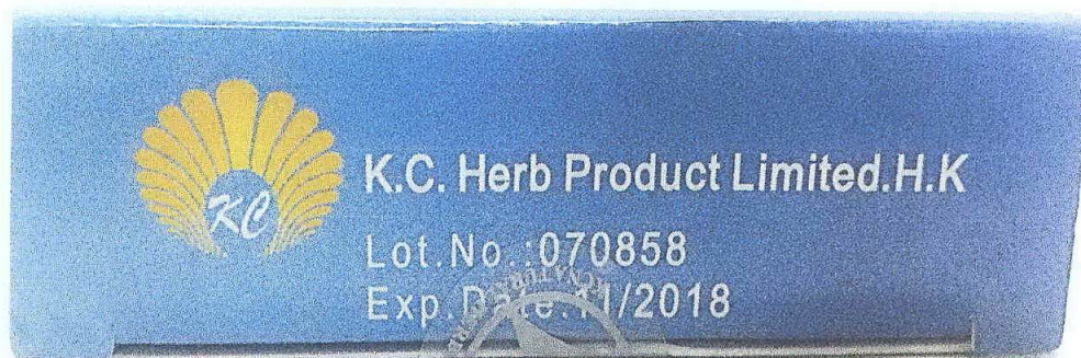
Figure 1. Unregistered UA-BLOCK Uric Acid Block Herbal Supplement