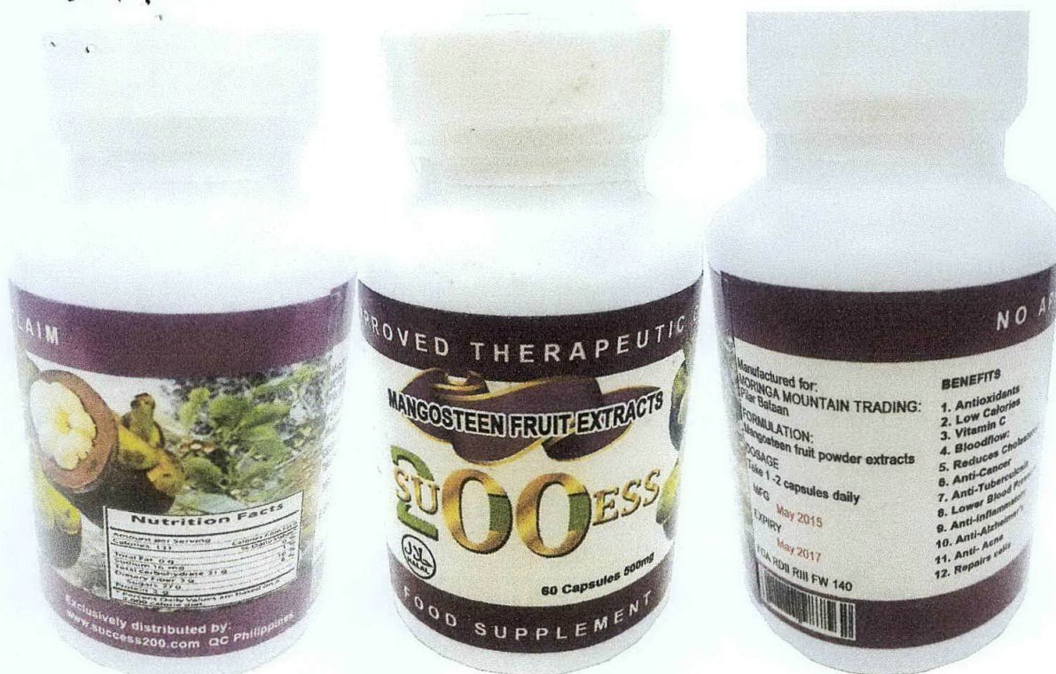
Figure 2. Unregistered Success 200 Mangosteen Fruit Extracts Food Supplement

FDA post-marketing surveillance (PMS) activities have verified that the abovementioned food supplements have not gone through the registration process of the agency and have not been issued the proper authorization in the form of Certificate of Product Registration. Pursuant to Republic Act No. 9711, otherwise known as the “Food and Drug Administration Act of 2009”, the manufacture, importation, exportation, sale, offering for sale, distribution, transfer, non-consumer use, promotion, advertising or sponsorship of health products without the proper authorization from FDA is prohibited.