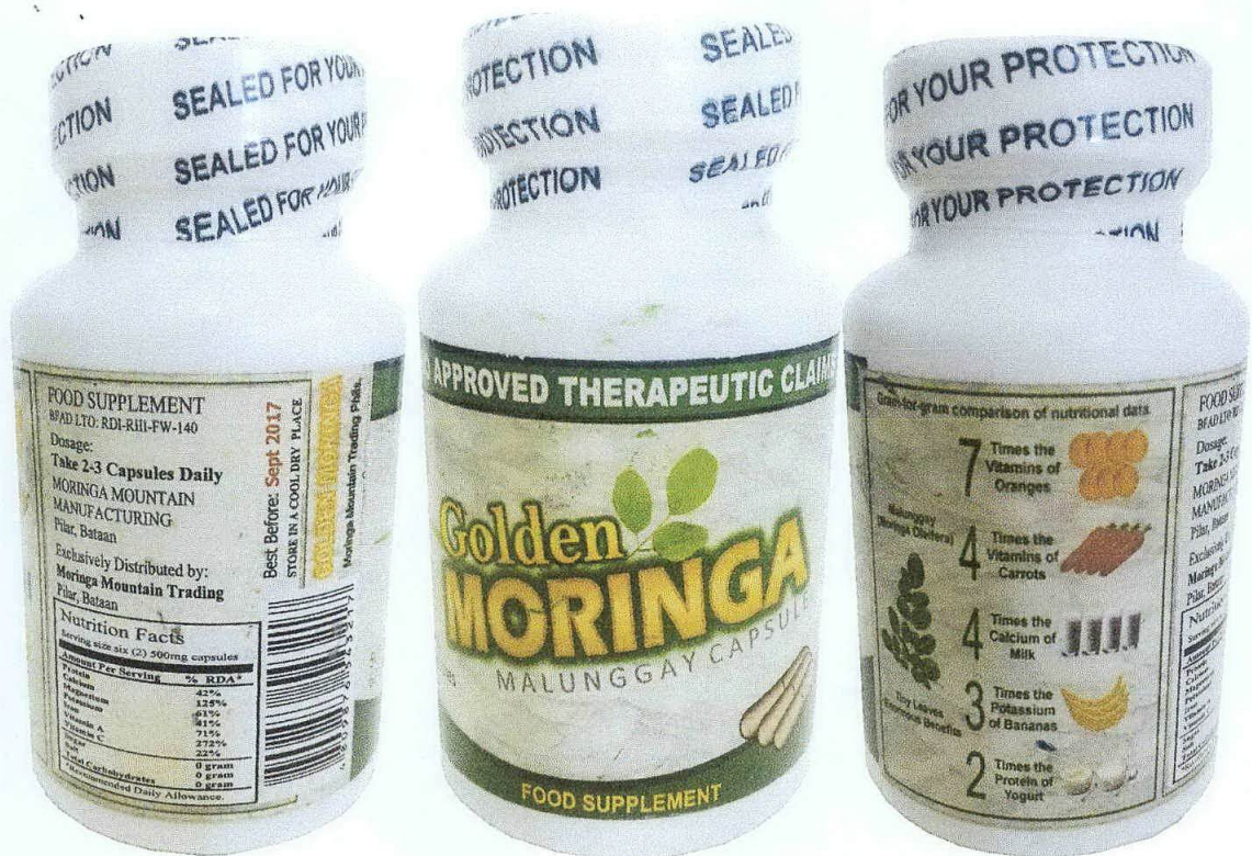
Figure 2. Unregistered Golden Moringa Malunggay Capsule