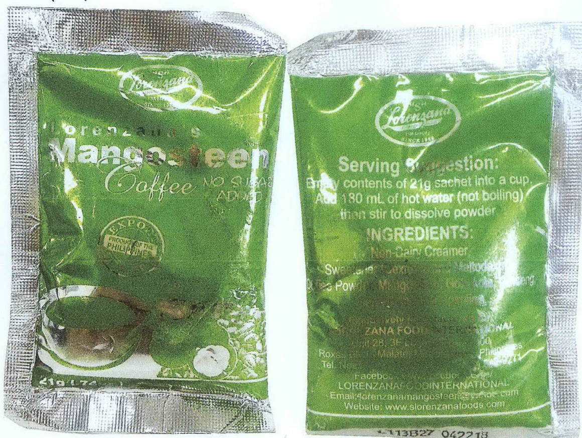
Figure 4. Unregistered Lorenzana's Mangosteen Coffee

FDA post-marketing surveillance (PMS) activities have verified that the abovementioned food supplements and food product have not gone through the registration process of the agency and have not been issued the proper authorization in the form of Certificate of Product Registration. Pursuant to Republic Act No. 9711, otherwise known as the "Food and Drug Administration Act of 2009", the manufacture, importation, exportation, sale, offering for sale, distribution, transfer, non-consumer use, promotion, advertising or sponsorship of health products without the proper authorization from FDA is prohibited.