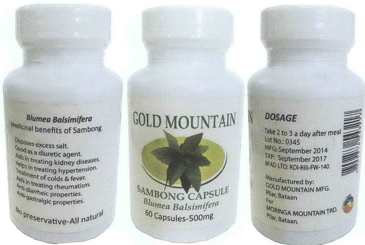
Figure 1. Unregistered Gold Mountain Sambong Capsule Blumea balsimifera

The Food and Drug Administration (FDA) advises the public against the purchase and consumption of the following unregistered food supplements and food product: