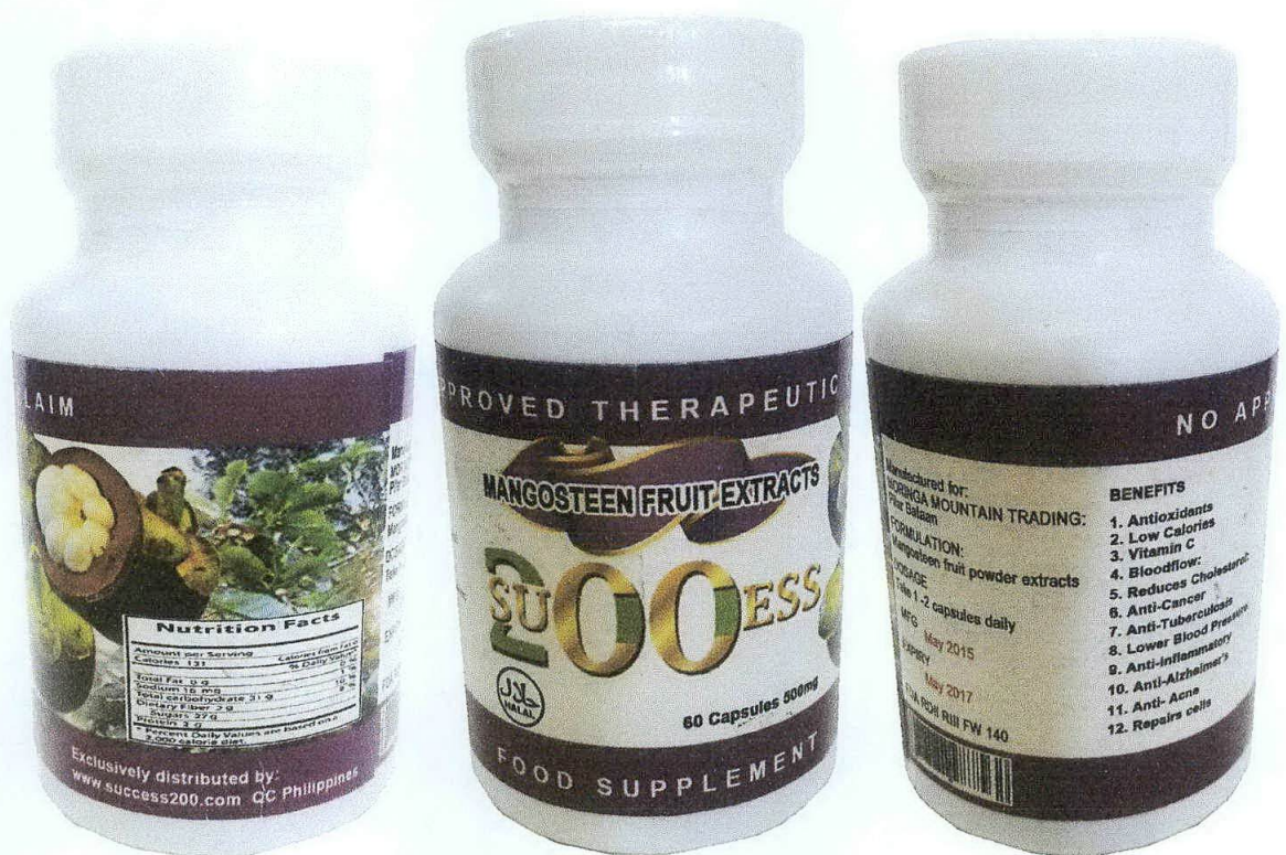
Figure 3. Unregistered Mangosteen Fruit Extracts Success 200