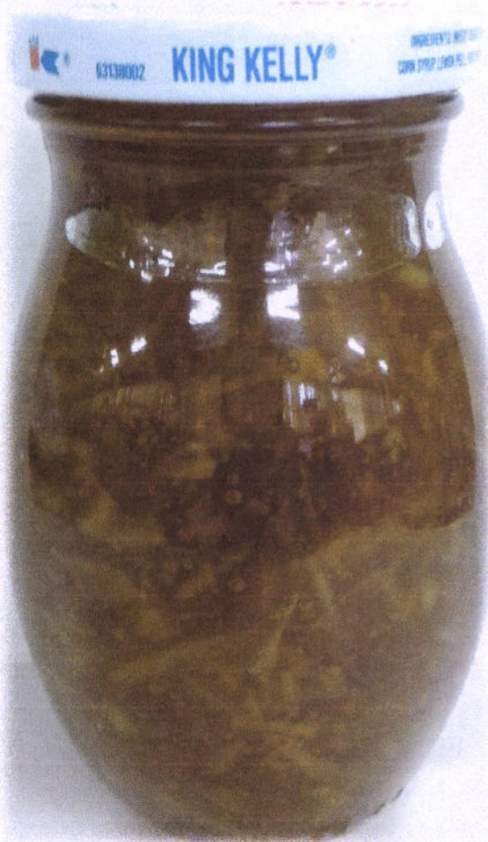
Figure 2. Unregistered King Kelly Orange Marmalade