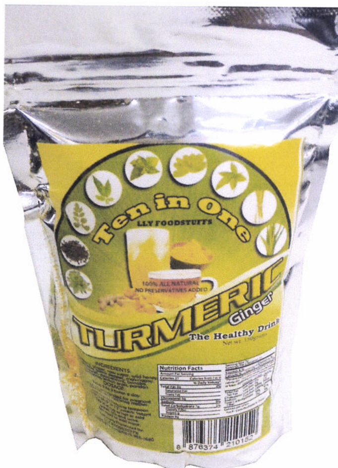
Figure 1. Unregistered Ten in One Turmeric Ginger

The Food and Drug Administration (FDA) advises the public against the purchase and consumption of the following unregistered food products: