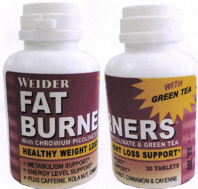
Figure 3. Unregistered Weider Fat Burners with Chromium Picolinate & Green Tea