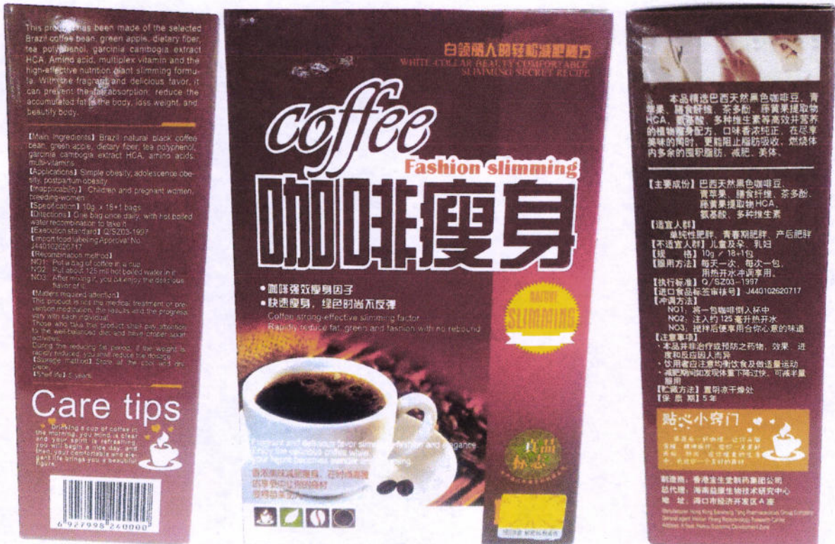
Figure 2. Unregistered Coffee Fashion Slimming