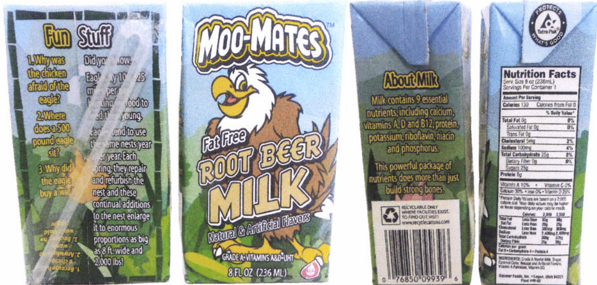
Figure 1. Unregistered Moo-Mates Fat Free Root Beer Milk Natural & Artificial Flavors

The Food and Drug Administration (FDA) advises the public against the purchase and consumption of the following unregistered food products and food supplement: