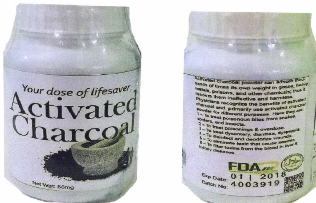
Figure 1. Unregistered Activated Charcoal

The Food and Drug Administration (FDA) advises the public against the use of the following unregistered food supplements: