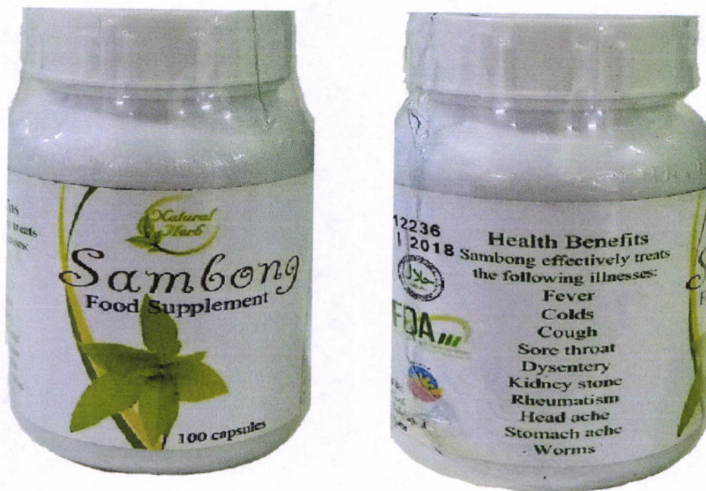
Figure 3. Unregistered Natural Herb Sambong Food Supplement

FDA post-marketing surveillance (PMS) activities have verified that the abovementioned food supplements have not gone through the registration process of the agency and have not