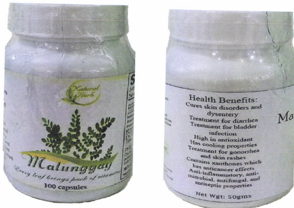
Figure 1. Unregistered Natural Herb Malunggay Food Supplement

The Food and Drug Administration (FDA) advises the public against the use of the following unregistered food supplements: