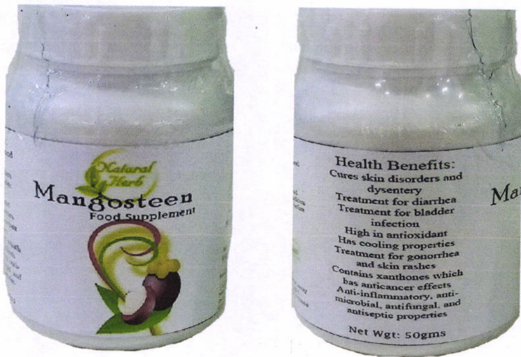
Figure 2. Unregistered Natural Herb Mangosteen Food Supplement