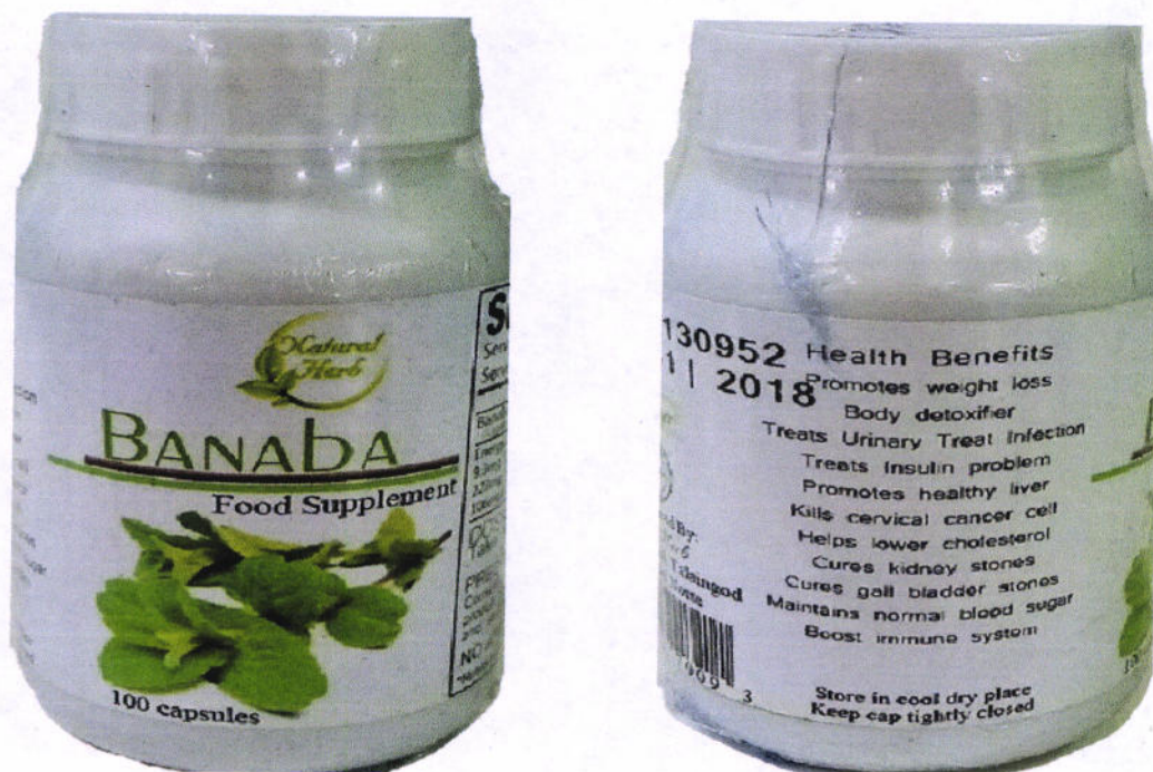
Figure 3. Unregistered Natural Herb Banaba Food Supplement