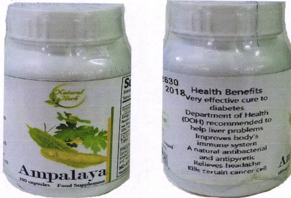
Figure 2. Unregistered Natural Herb Ampalaya Food Supplement