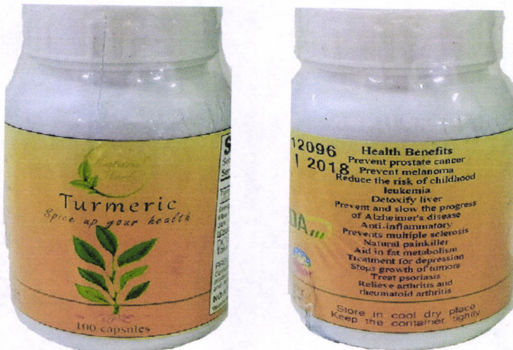
Figure 1. Unregistered Natural Herb Turmeric

The Food and Drug Administration (FDA) advises the public against the purchase and consumption of the following unregistered food supplements: