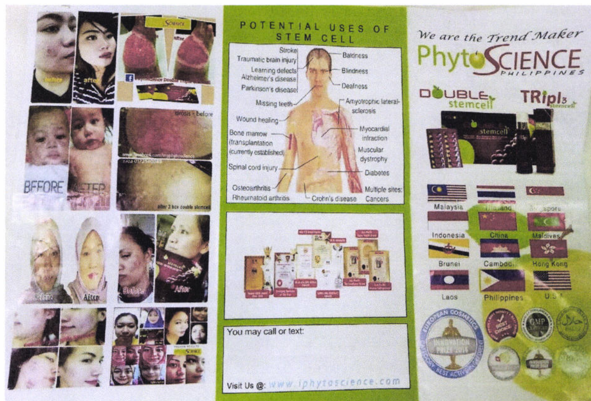
Figure 1. Front page of the sample brochure of unregistered Phyto Science Double Stemcell

The Food and Drug Administration (FDA) advises the public against the purchase and consumption of the following unregistered food supplement: