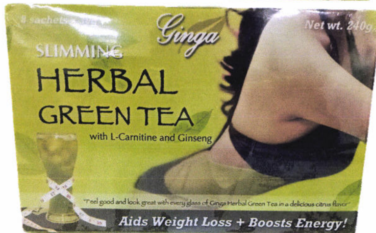
Figure 1. Unregistered GINGA Slimming Herbal Tea with L-Carnitine and Ginseng