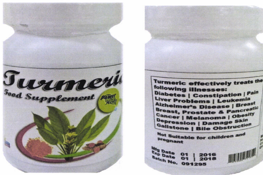
Figure 2. Unregistered Turmeric Food Supplement Power Herbs

FDA post-marketing surveillance (PMS) activities have verified that the abovementioned food supplements have not gone through the registration process of the agency and have not been issued the proper authorization in the form of Certificate of Product Registration. Pursuant to Republic Act No. 9711, otherwise known as the “Food and Drug Administration Act of 2009”, the manufacture, importation, exportation, sale, offering for sale, distribution, transfer, non-consumer use, promotion, advertising or sponsorship of health products without the proper authorization from FDA is prohibited.