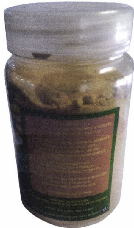
Figure 3. Information panel showing violative therapeutic claims