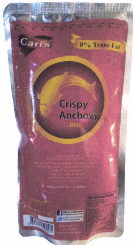
Figure 1. Carl's Crispy Anchovy Dilis

The Food and Drug Administration (FDA) advises the public against the purchase and consumption of the following unregistered food products food supplements: