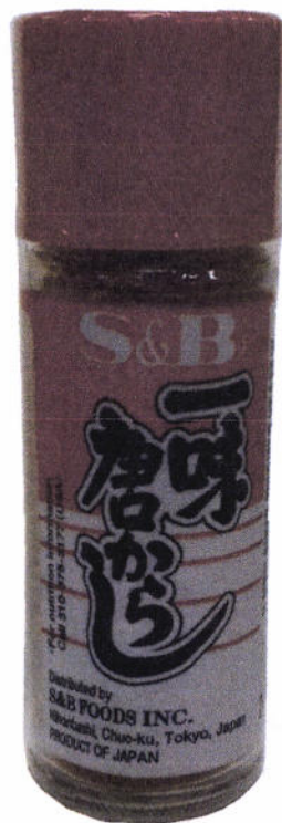
Figure 3. S&B Ichimi Togarashi Chili Pepper

FDA post-marketing surveillance (PMS) activities have verified that the abovementioned food product/s and/or food supplements have not gone through the registration process of the agency and have not been issued the proper authorization in the form of Certificate of