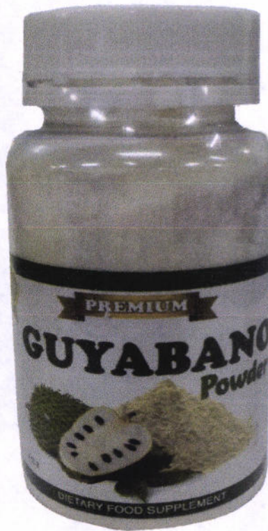
Figure 2. Premium Guyabano Powder