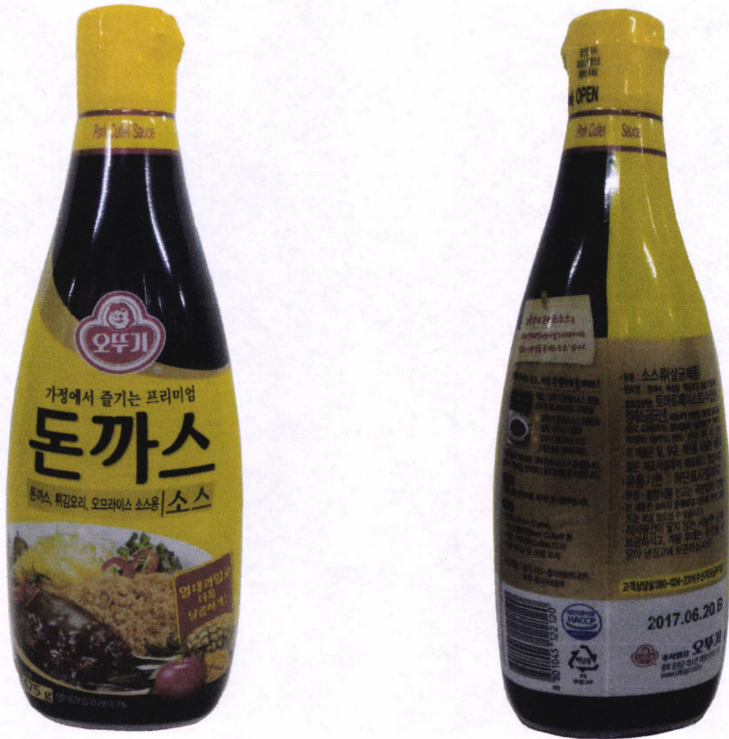
Figure 3. (In Korean Character) Pork Cutlet Sauce