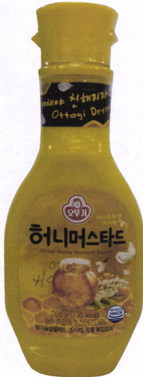
Figure 4. Ottogi Honey Mustard Sauce

FDA post-marketing surveillance (PMS) activities have verified that the abovementioned food products and food supplements have not gone through the registration process of the agency and have not been issued the proper authorization in the form of Certificate of Product Registration. Pursuant to Republic Act No. 9711, otherwise known as the “Food and Drug Administration Act of 2009”, the manufacture, importation, exportation, sale, offering for sale, distribution, transfer, non-consumer use, promotion, advertising or sponsorship of health products without the proper authorization from FDA is prohibited.