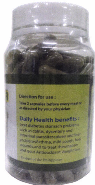
Figure 1.1. Information panel showing violative therapeutic claims