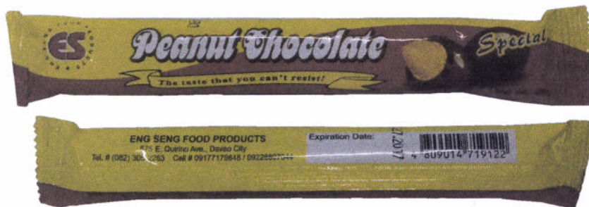
Figure 2. ES Special Peanut Chocolate