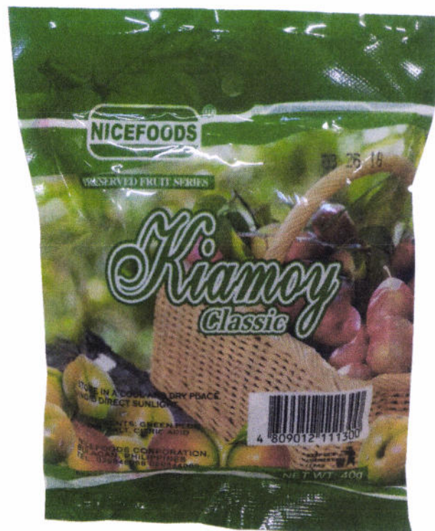
Figure 4. Nicefoods Preserved Fruit Series Kiamoy Classic