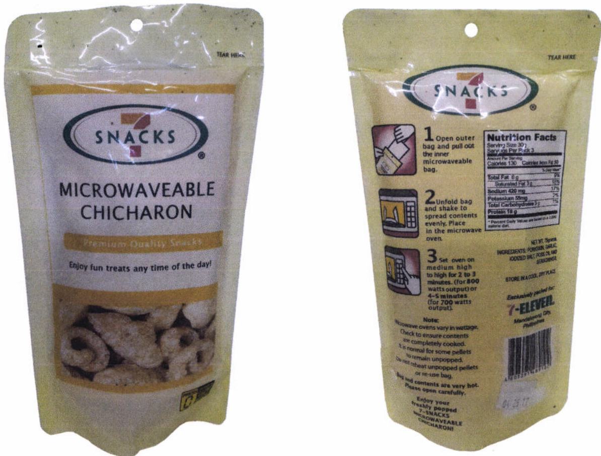
Figure 3. 7 Snacks Microwaveable Chicharon Premium Quality Snacks