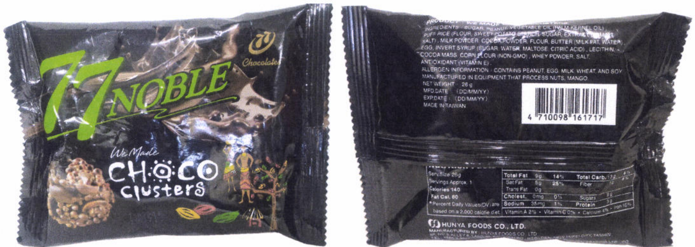
Figure 1. 77 Noble We Made Choco Clusters

The Food and Drug Administration (FDA) advises the public against the purchase and consumption of the following unregistered food products: