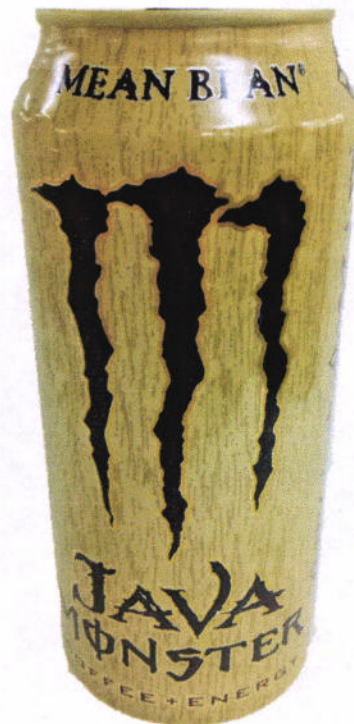
Figure 4. Unregistered Mean Bean Java Monster Coffee Energy Drink