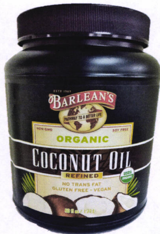
Figure 6. Unregistered Barlean's Organic Coconut Oil Refined