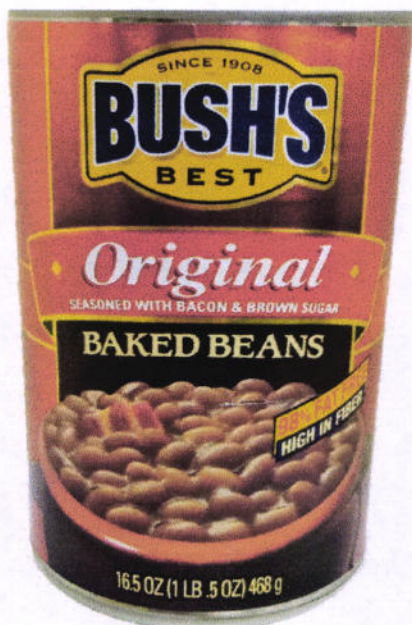
Figure 1. Unregistered Bush's Best Original Baked Beans

The Food and Drug Administration (FDA) advises the public against the purchase and consumption of the following unregistered food products: