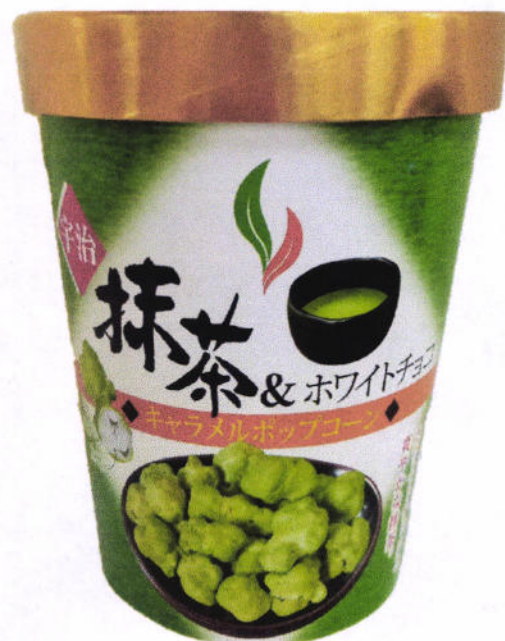
Figure 2. Unregistered Green Tea Popcorn (in foreign characters)