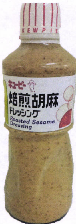
Figure 5. Unregistered Kewpie Roasted Sesame Dressing (in foreign characters)