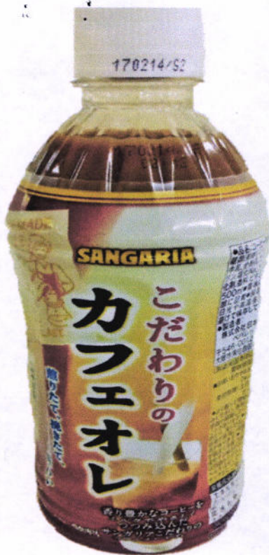
Figure 3. Unregistered Sangaria Coffee Drink (in foreign characters)