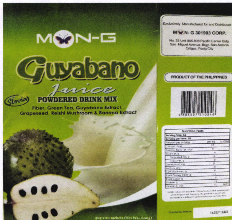
Figure 2. Unregistered MON-G Guyabano Juice Powdered Drink Mix with Stevia

FDA post-marketing surveillance (PMS) activities have verified that the abovementioned food product and food supplement have not gone through the registration process of the agency and have not been issued the proper authorization in the form of Certificate of Product Registration. Pursuant to Republic Act No. 9711, otherwise known as the “Food and Drug Administration Act of 2009”, the manufacture, importation, exportation, sale, offering for sale, distribution, transfer, non-consumer use, promotion, advertising or sponsorship of health products without the proper authorization from FDA is prohibited.