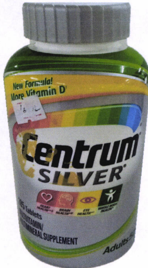
Figure 3. Unregistered Centrum Silver Multivitamin

FDA post-marketing surveillance (PMS) activities have verified that the abovementioned food supplements have not gone through the registration process of the agency and have not been issued the proper authorization in the form of Certificate of Product Registration. Pursuant to Republic Act No. 9711, otherwise known as the “Food and Drug Administration Act of 2009”, the manufacture, importation, exportation, sale, offering for sale, distribution, transfer, non-consumer use, promotion, advertising or sponsorship of health products without the proper authorization from FDA is prohibited.