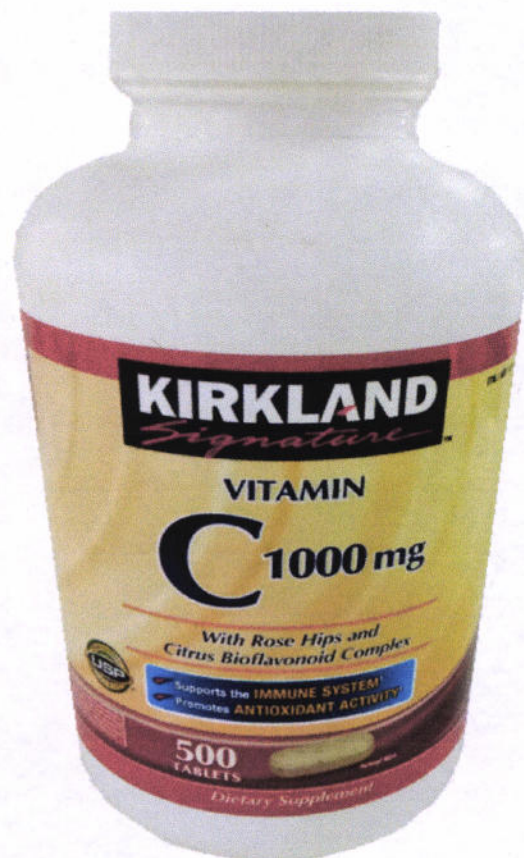
Figure 2. Unregistered Kirkland Signature Vitamin C 1000 mg