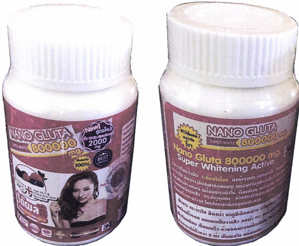
Figure 1. Unregistered Nano Gluta Super White 800,000 mg

The Food and Drug Administration (FDA) advises the public against the purchase and consumption of the unregistered food supplement Nano Gluta Super White 800,000 mg sold online: