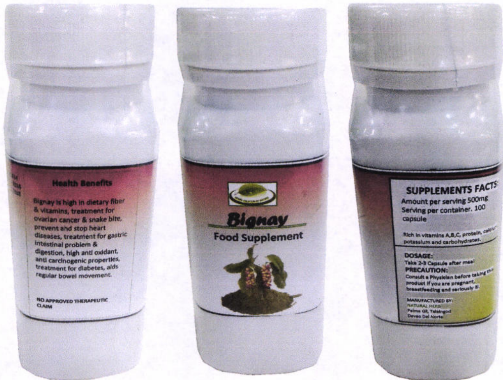
Figure 2. Unregistered Bignay Food Supplement 500 mg