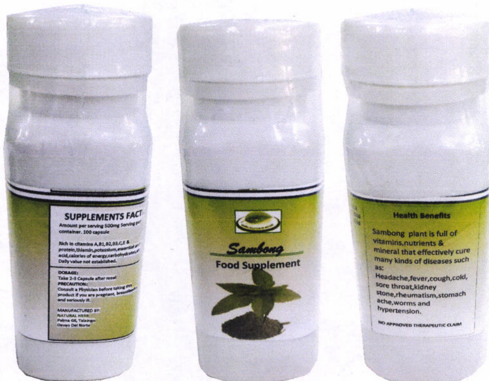
Figure 1. Unregistered Sambong Food Supplement 500 mg

The Food and Drug Administration (FDA) advises the public against the purchase and consumption of the following unregistered food supplements and food product: