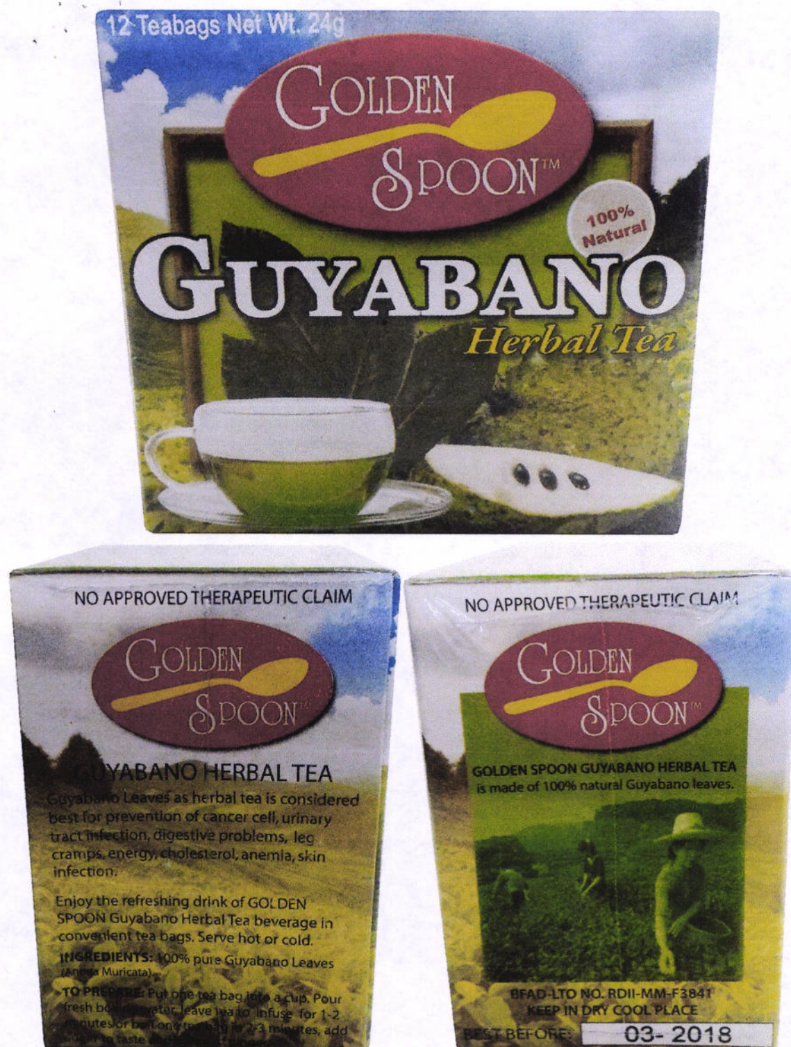
Figure 2. Unregistered Golden Spoon Guyabano Herbal Tea