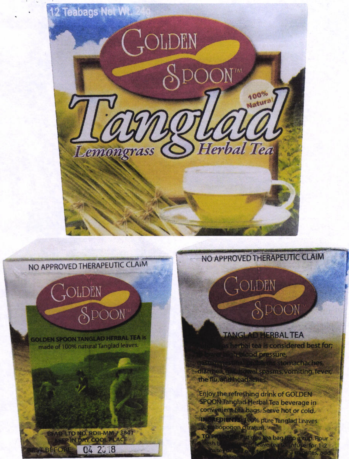
Figure 3. Unregistered Golden Spoon Tanglad Lemongrass Herbal Tea

FDA post-marketing surveillance (PMS) activities have verified that the abovementioned food supplement and food products have not gone through the registration process of the agency and have not been issued the proper authorization in the form of Certificate of Product Registration. Pursuant to Republic Act No. 9711, otherwise known as the “Food and Drug Administration Act of 2009”, the manufacture, importation, exportation, sale, offering