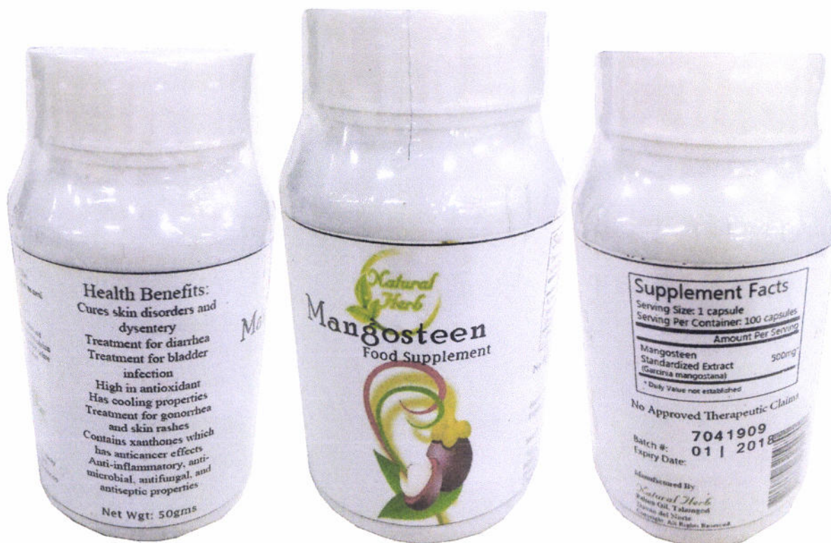
Figure 1. Unregistered Natural Herb Mangosteen Food Supplement

The Food and Drug Administration (FDA) advises the public against the purchase and consumption of the following unregistered food supplements: