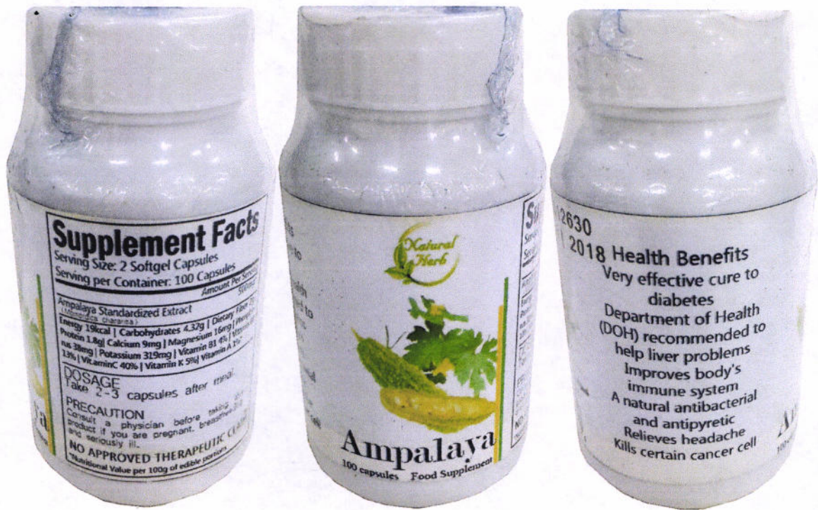
Figure 2. Unregistered Natural Herb Ampalaya Food Supplement