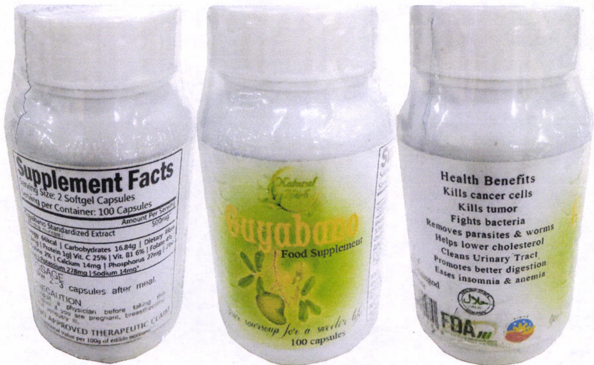
Figure 3. Unregistered Natural Herb Guyabano Food Supplement

FDA post-marketing surveillance (PMS) activities have verified that the abovementioned food supplements have not gone through the registration process of the agency and have not been issued the proper authorization in the form of Certificate of Product Registration. Pursuant to Republic Act No. 9711, otherwise known as the “Food and Drug Administration