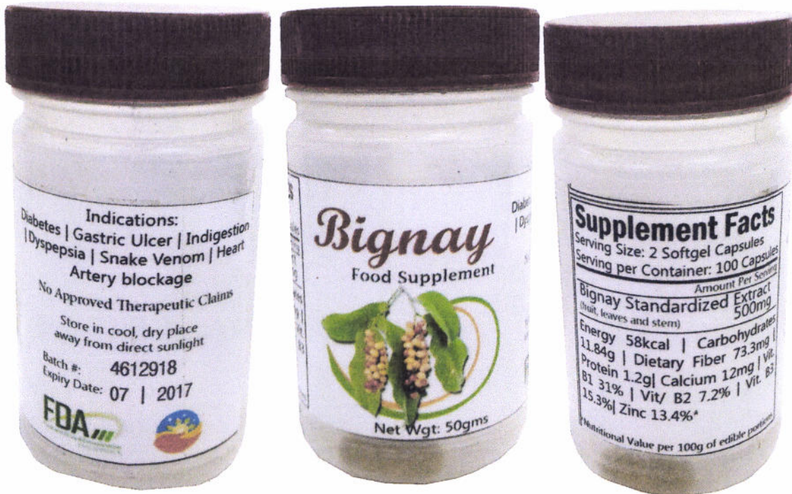
Figure 1. Unregistered Bignay Food Supplement

The Food and Drug Administration (FDA) advises the public against the purchase and consumption of the following unregistered food supplements: