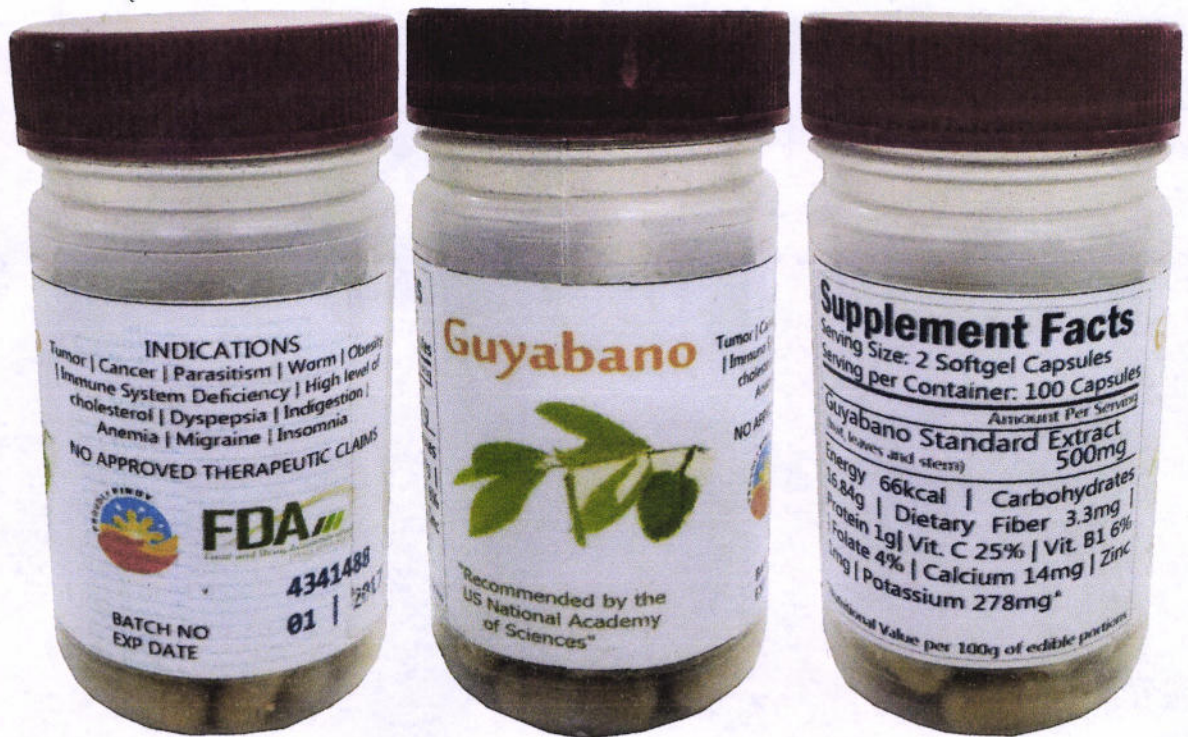
Figure 2. Unregistered Guyabano Capsules