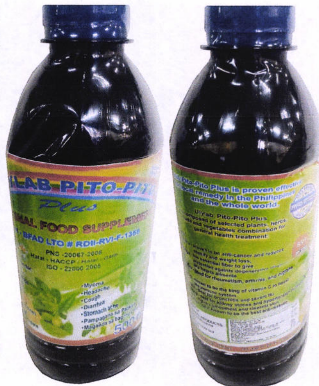
Figure 3. Unregistered Ulylab Pito-Pito Plus